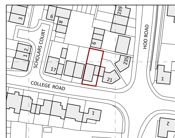
LOCATION PLAN AS EXISTING | Scale 1:1250