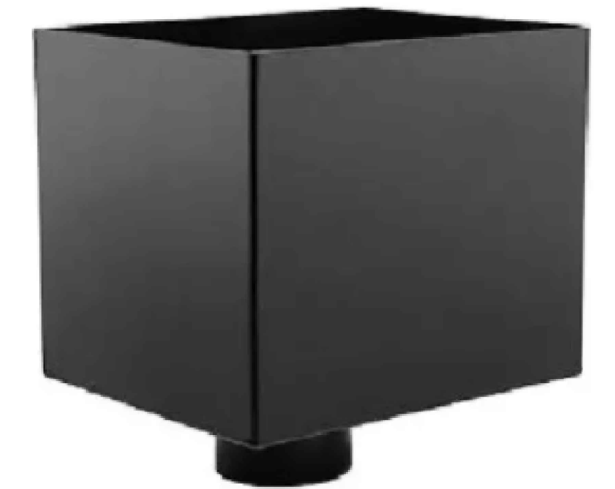
Aluminium Rainwater Goods (anthracite grey)