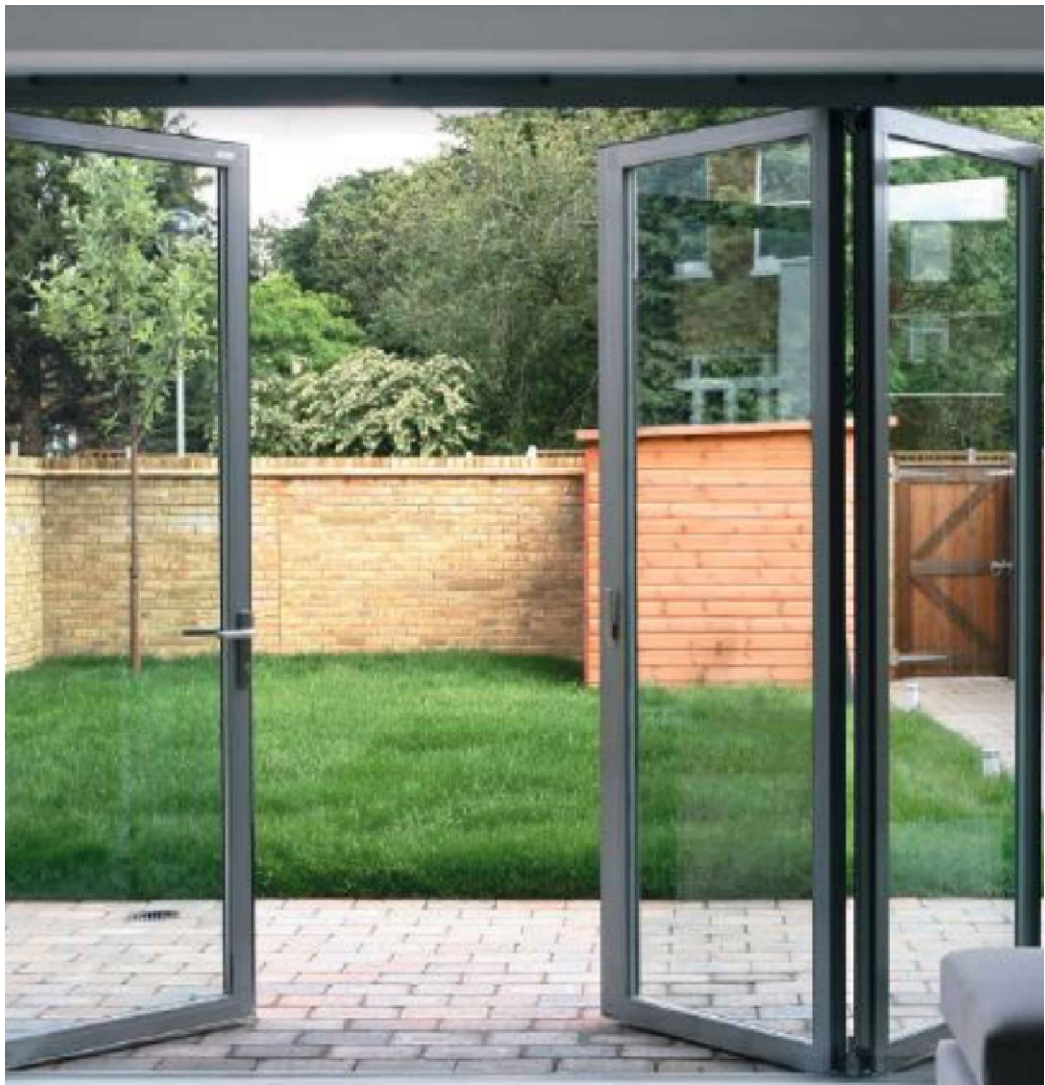
Velfac Aluminium Bi-fold Doors & Windows (colour anthracite grey)