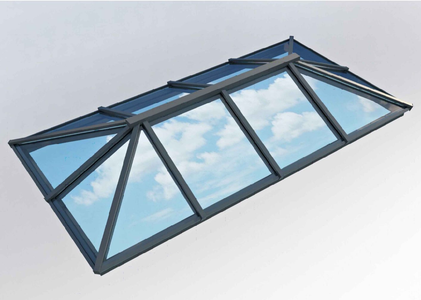
Aluminium Framed Roof Lantern (anthracite grey)