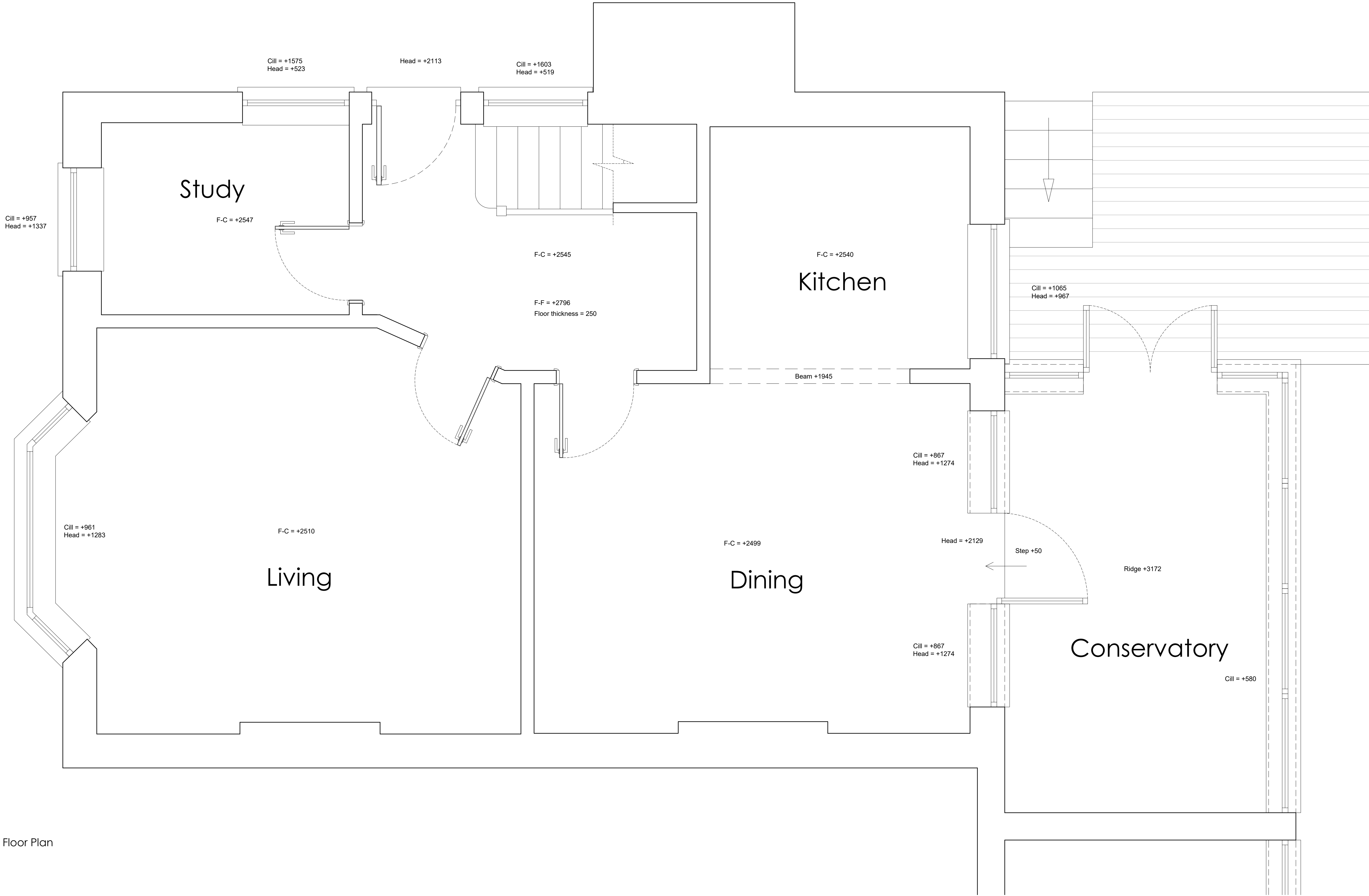
Existing Floor Plan 1:20