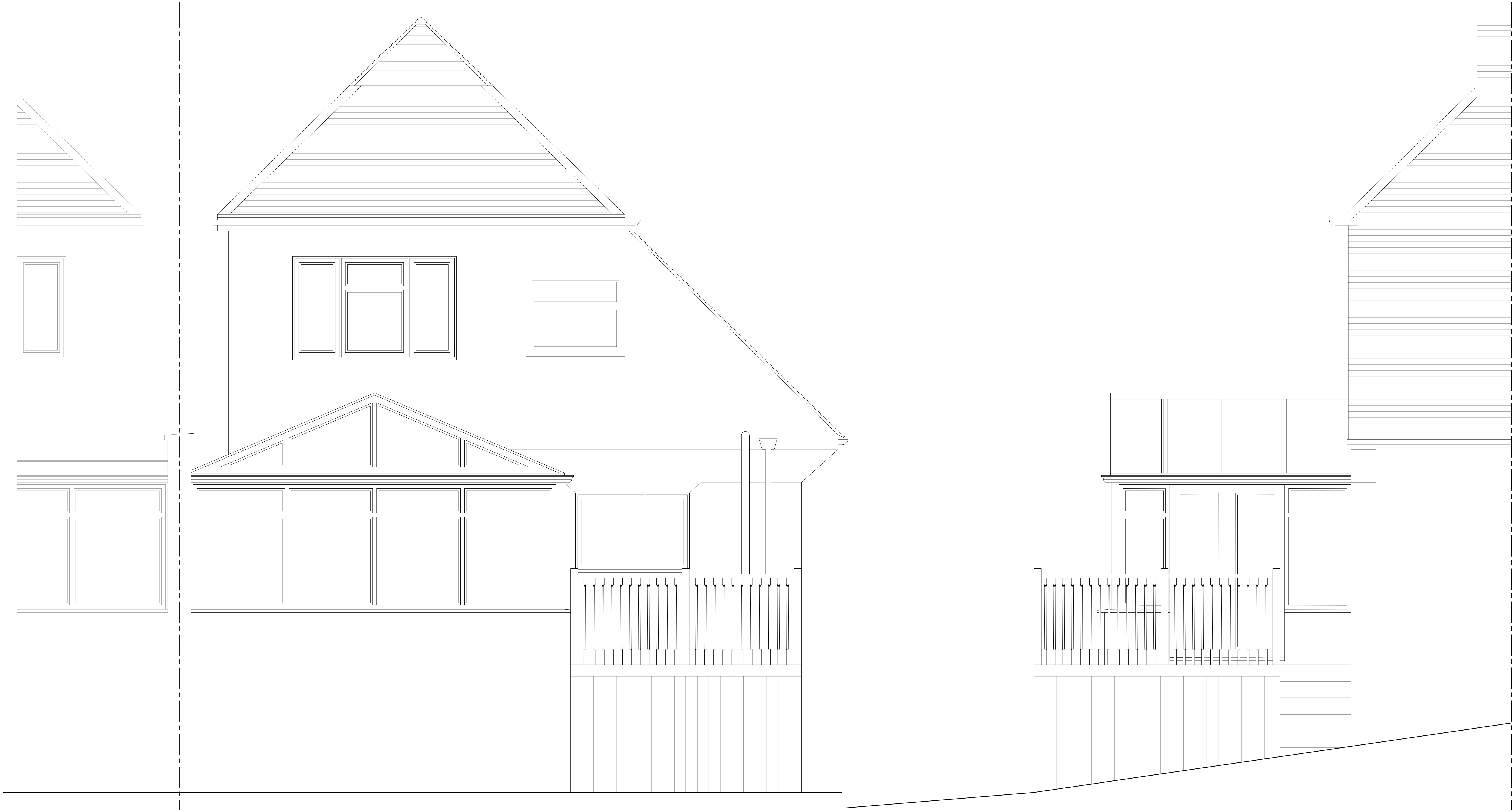
Existing (South) Rear Elevation 1:25