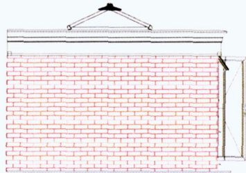
LEFT VIEW Scale 1:100

HAVANT BOROUGH COUNCIL 16 APR 2021 RECEIVED