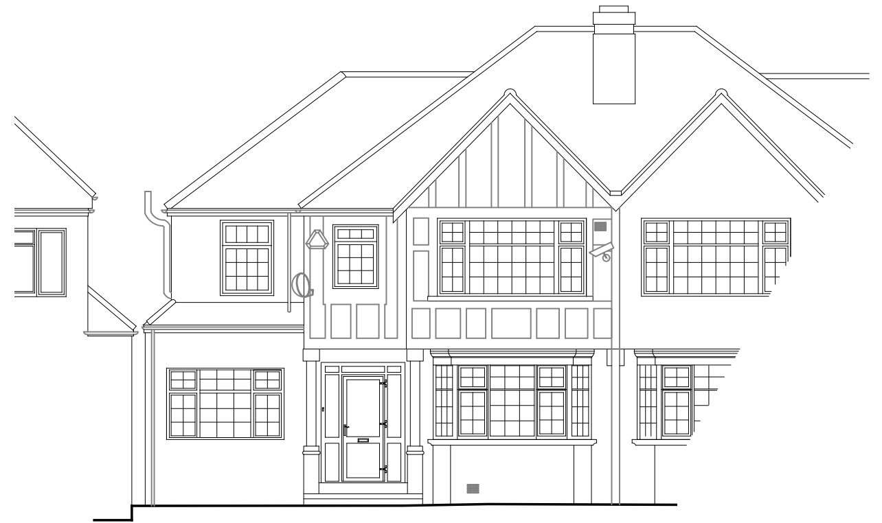
X EXISTING Front Elevation 1:100@A3