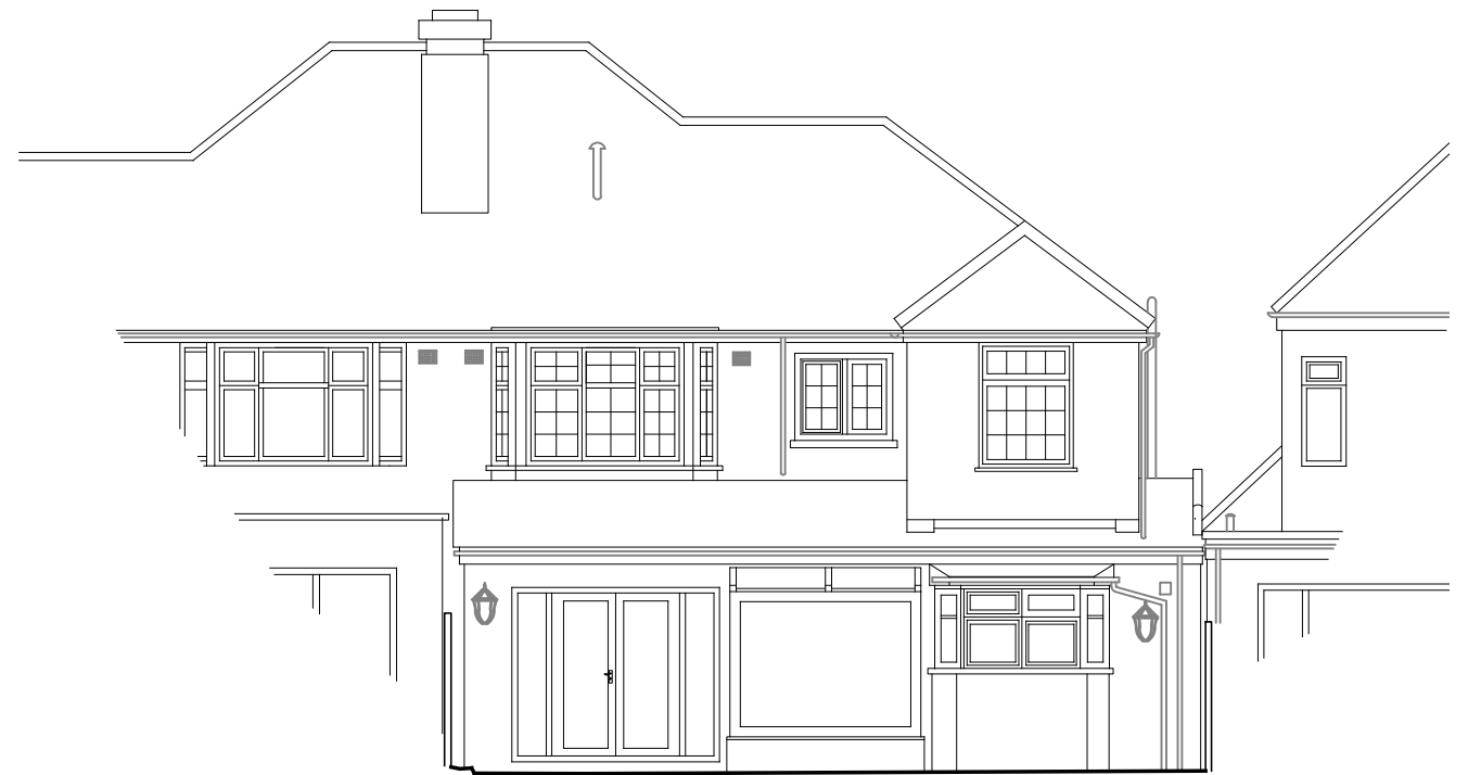
X EXISTING Rear Elevation 1:100@A3