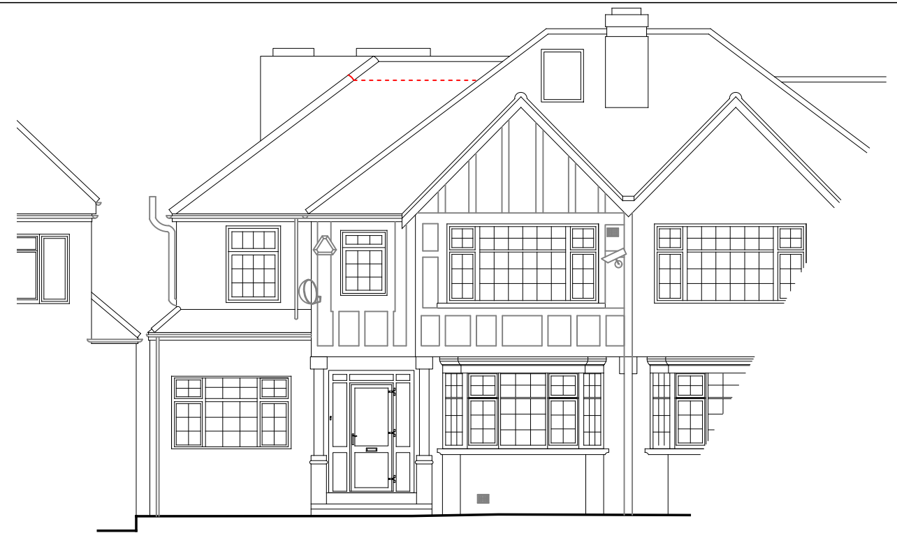
PROPOSED Opt.1 Front Elevation 1:100@A3

Previous roof volume addition with side extension = ~25m3 (App. ref: C16285/05) Proposed further addition = 14.5m3