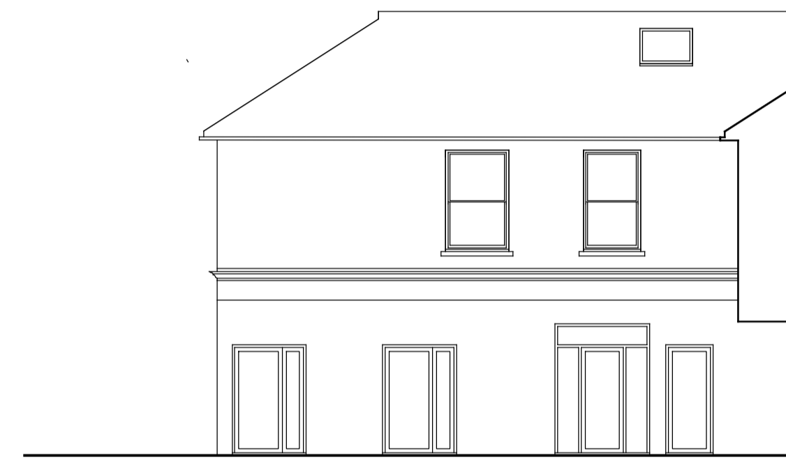
part south west elevation as existing