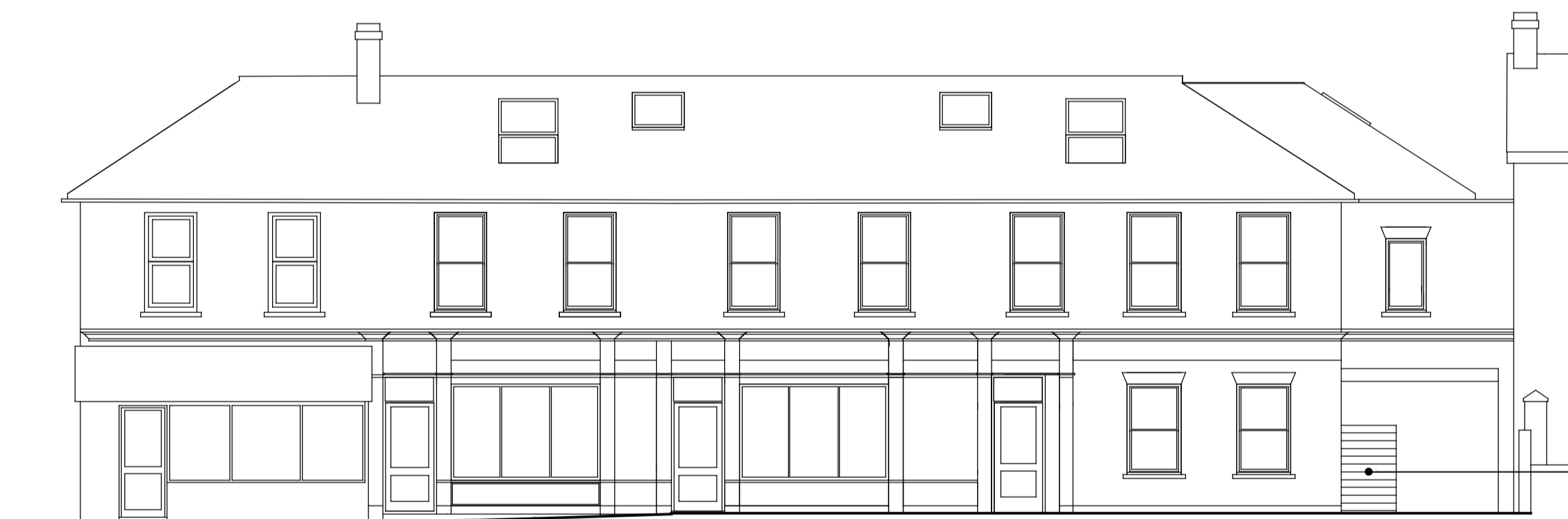
north west elevation as proposed