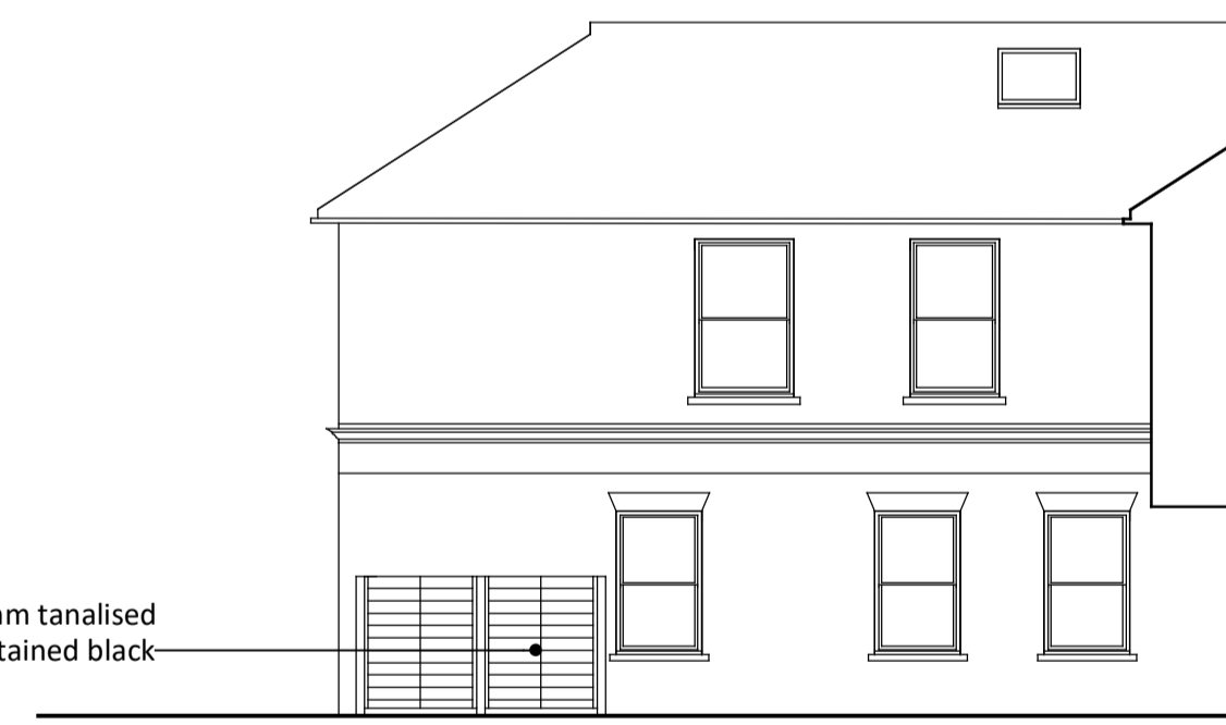
part south west elevation as proposed