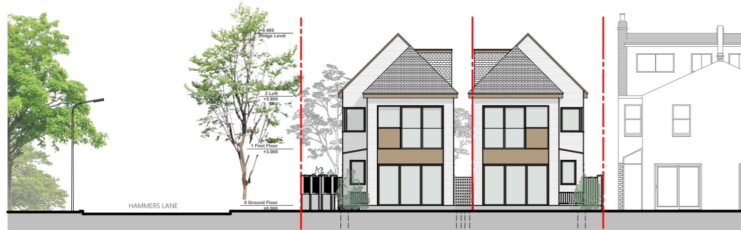
N North (Rear) Elevation scale 1:200