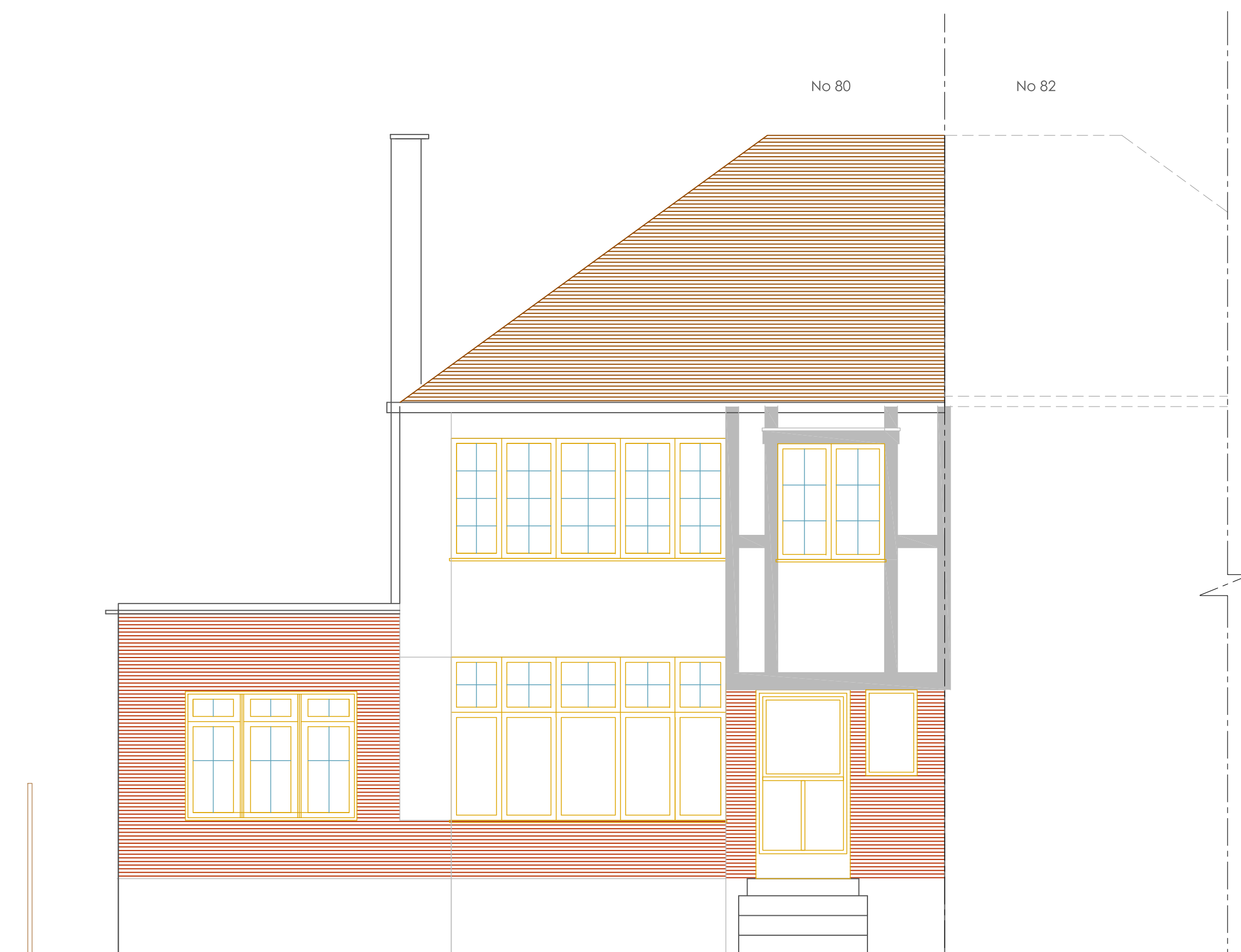
ELE EXISTING FRONT ELEVATION Scale: A3 1:100 A1 1:50