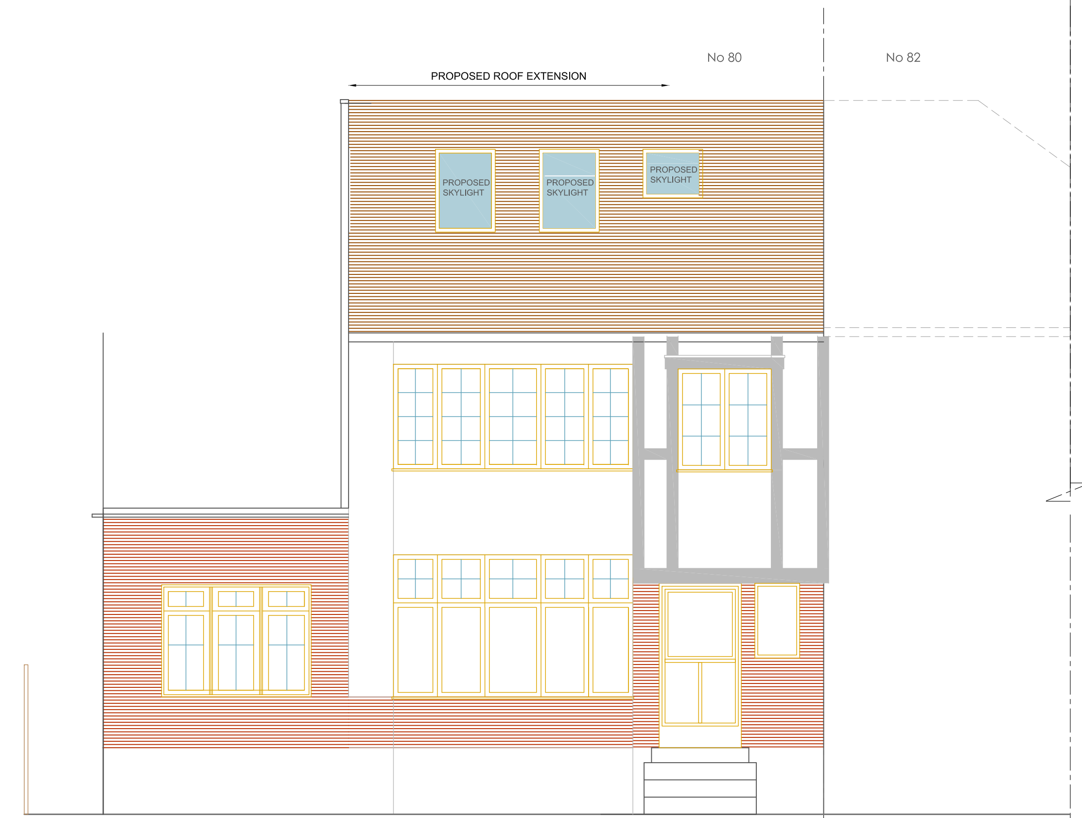
ELE PROPOSED FRONT ELEVATION with side extension Scale: A3 1:100 A1 1:50