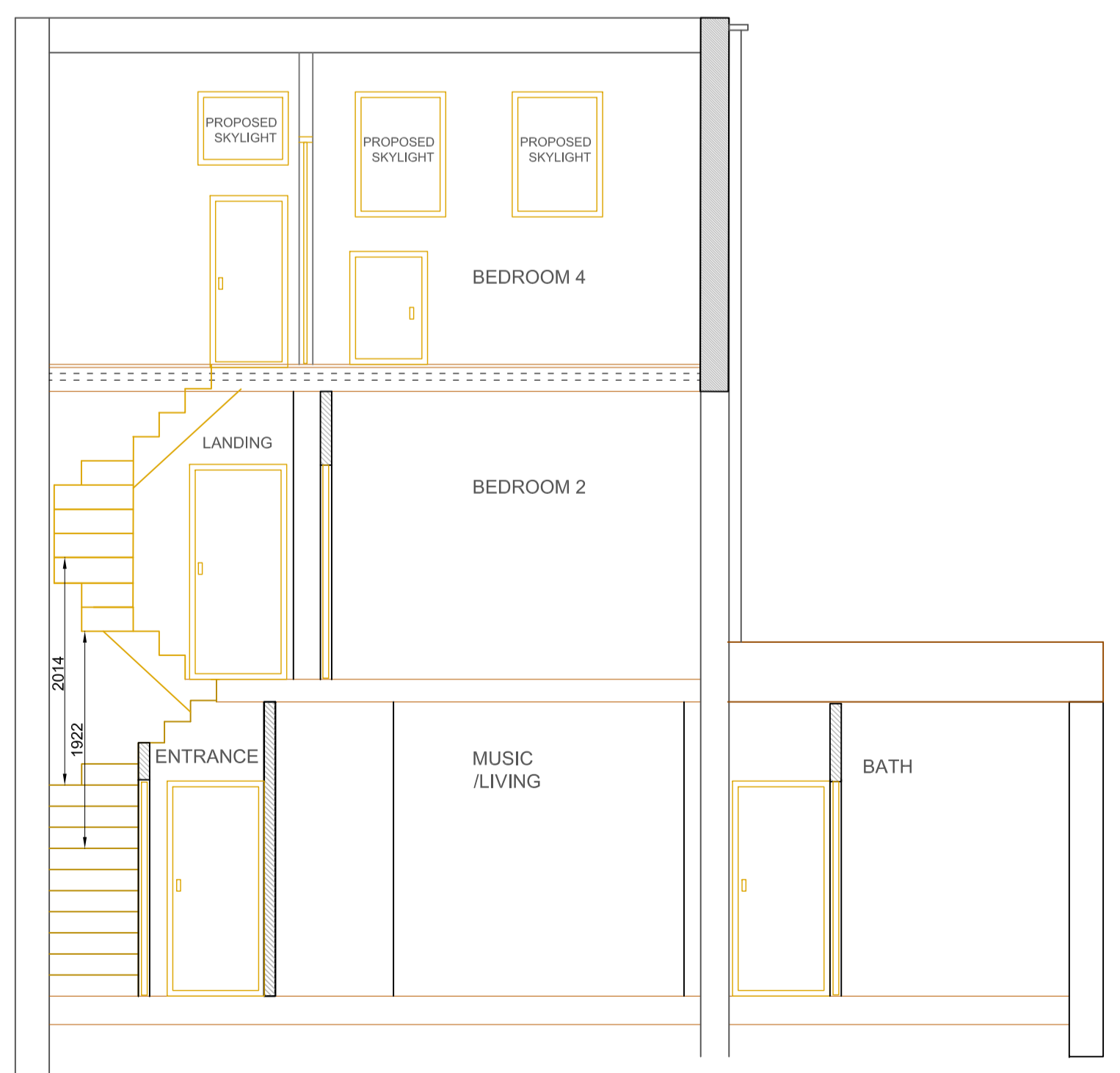
SEC PROPOSED SECTION AA Scale: A3 1:100 A1 1:50