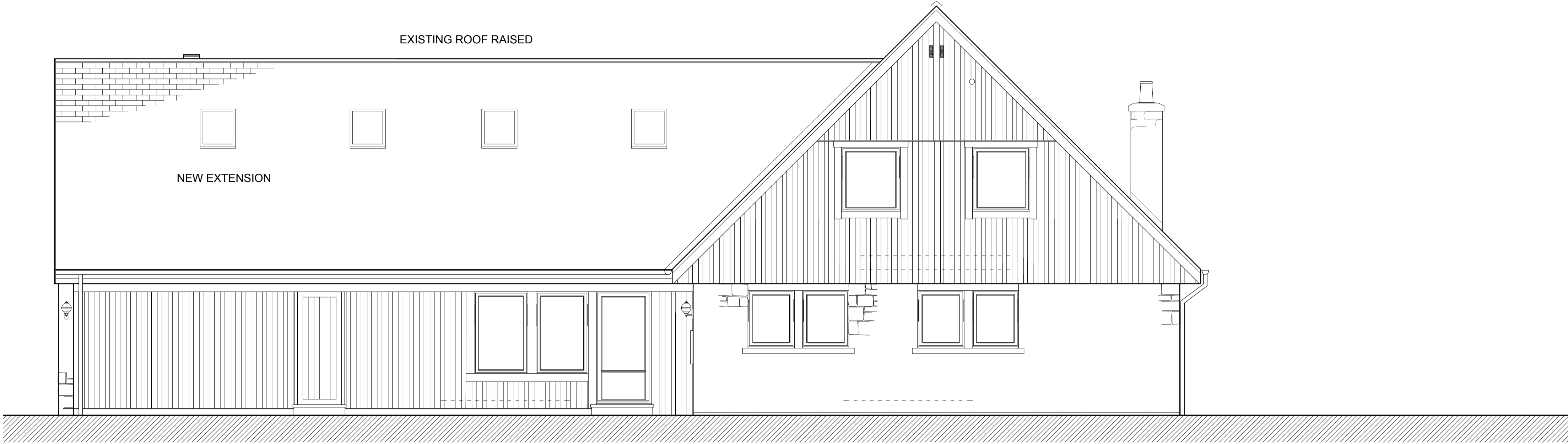
Proposed Eastern Elevation