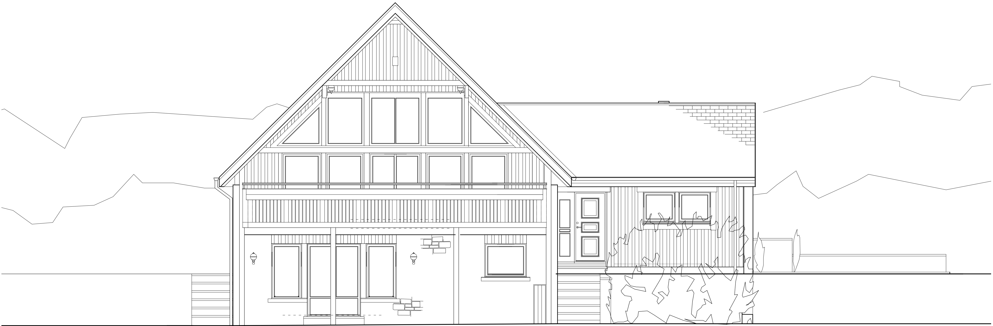
Existing Western Elevation

Discrepancies, ambiguities and/or omissions between this drawing and information given elsewhere must be reported to the architect before proceeding. This drawing is copyright. Dimensions must be checked on site. Do not scale off dimensions from this drawing.