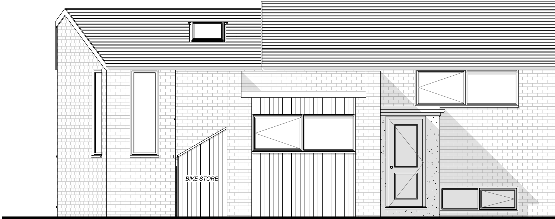
1 03.A1 Proposed Front Elevation 1 : 50