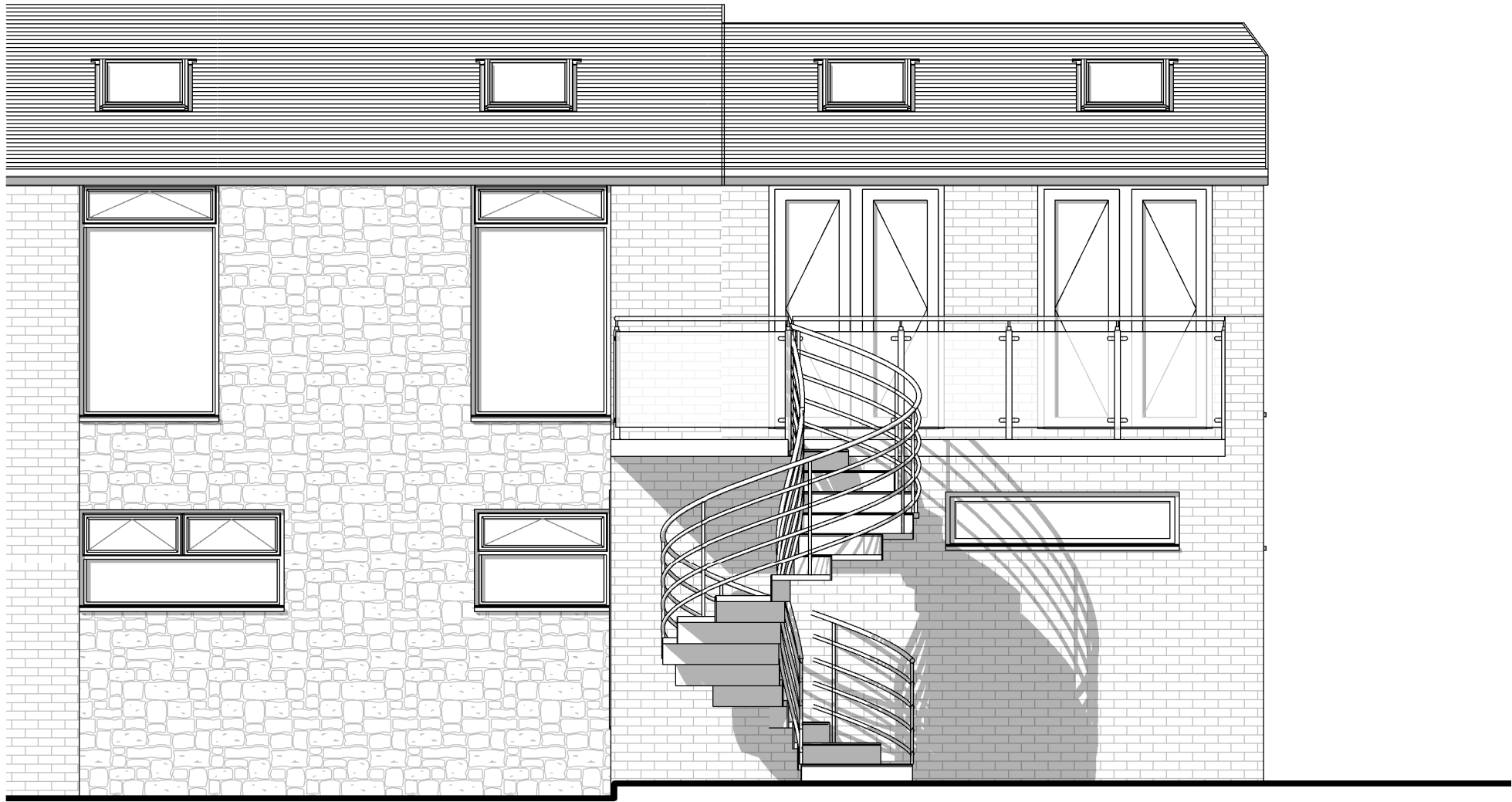
2 03.A1 Proposed Rear Elevation 1 : 50