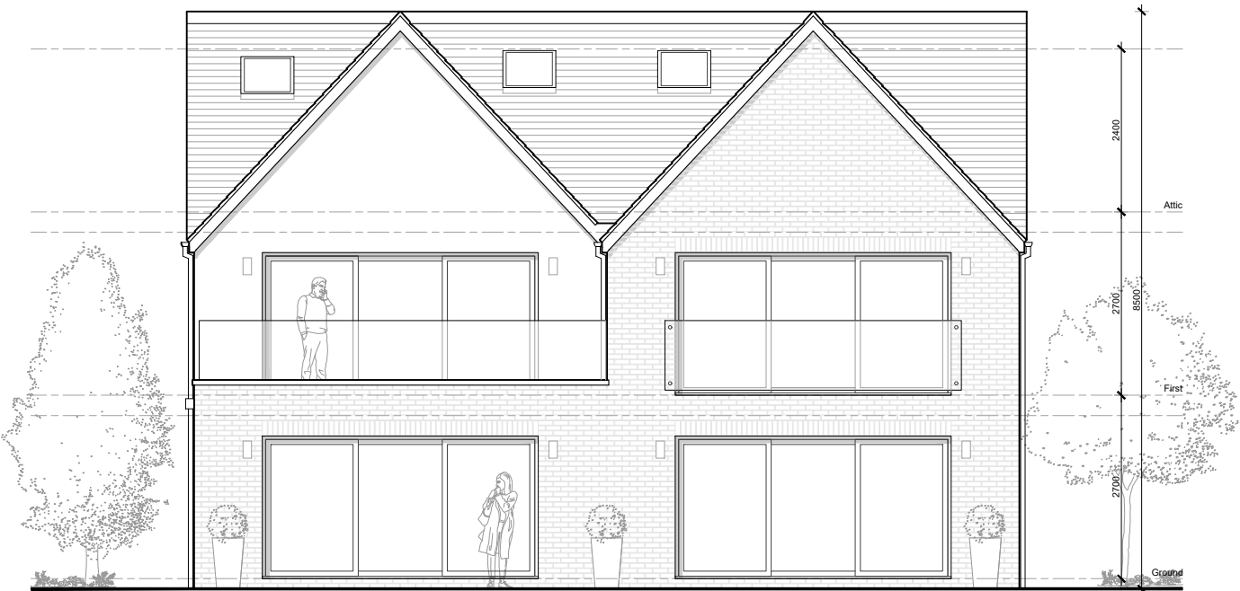
EAST ELEVATION (REAR)

Mixture of brick (Wienerberger Hathaway Brindled) and rendered (Ivory) walls with feature stone sill and brick soldier course detailing throughout.