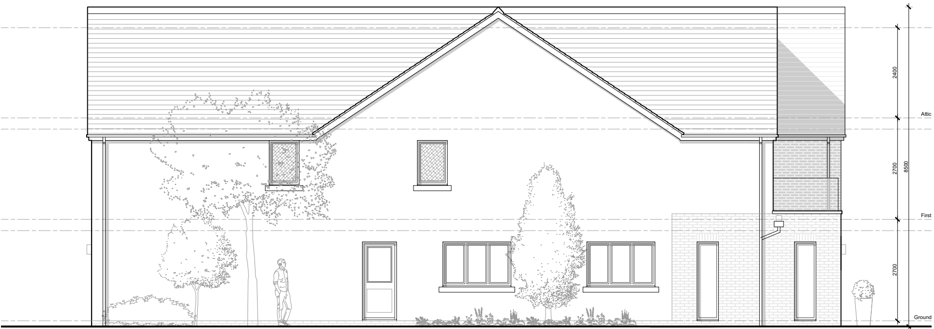
SOUTH ELEVATION (SIDE)