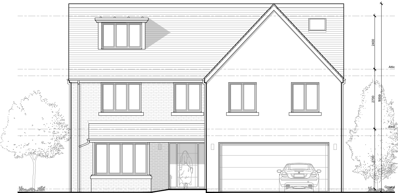
WEST ELEVATION (FRONT)

Mixture of brick (Wienerberger Hathaway Brindled) and rendered (Ivory) walls with feature stone sill and brick soldier course detailing throughout.