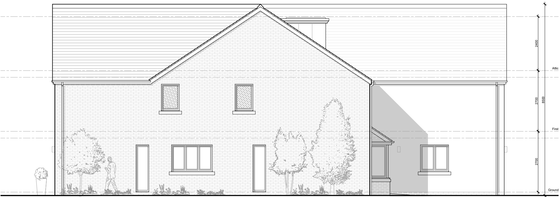
NORTH ELEVATION (SIDE)