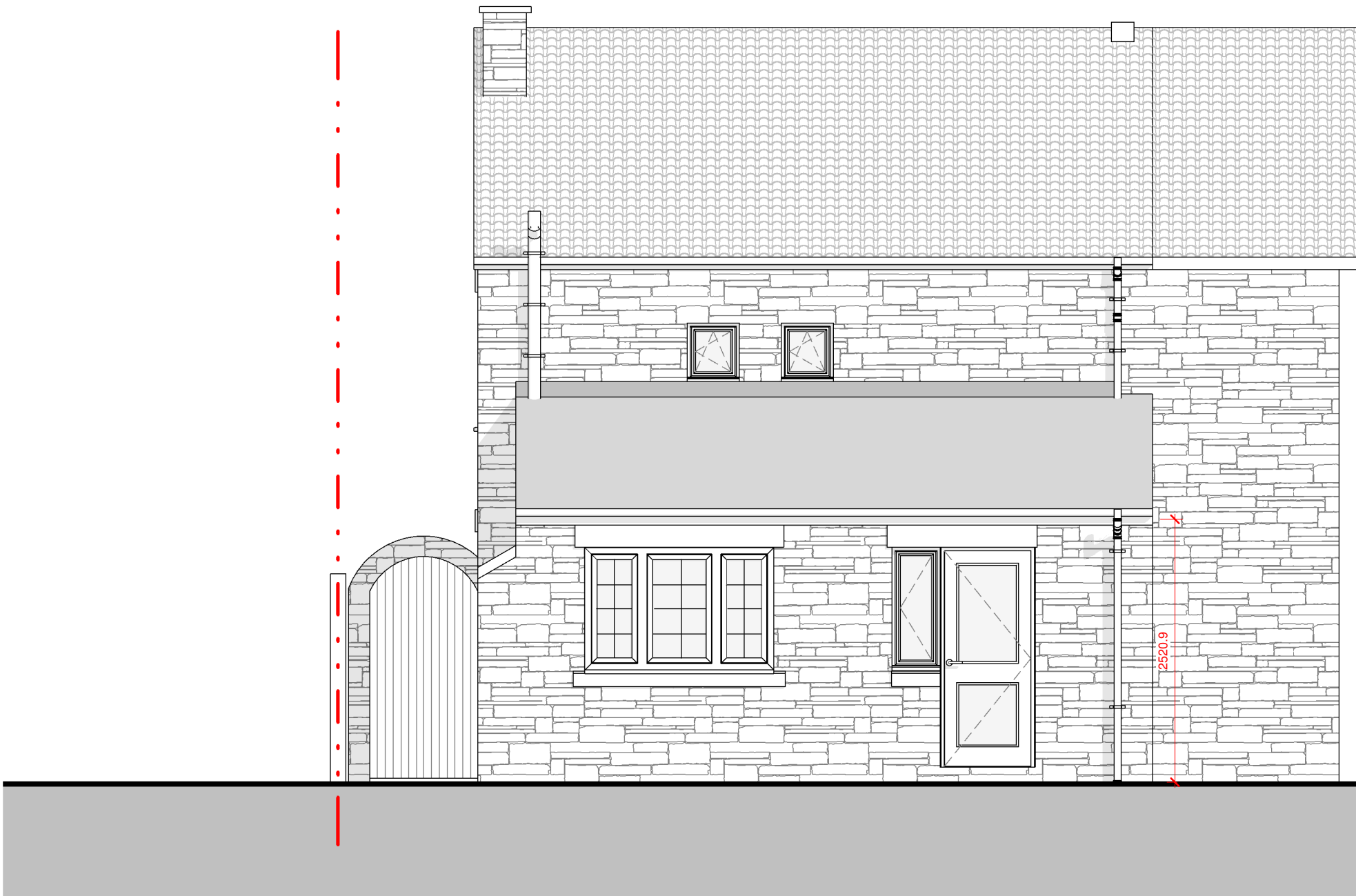
0.2 Existing Rear Elevation