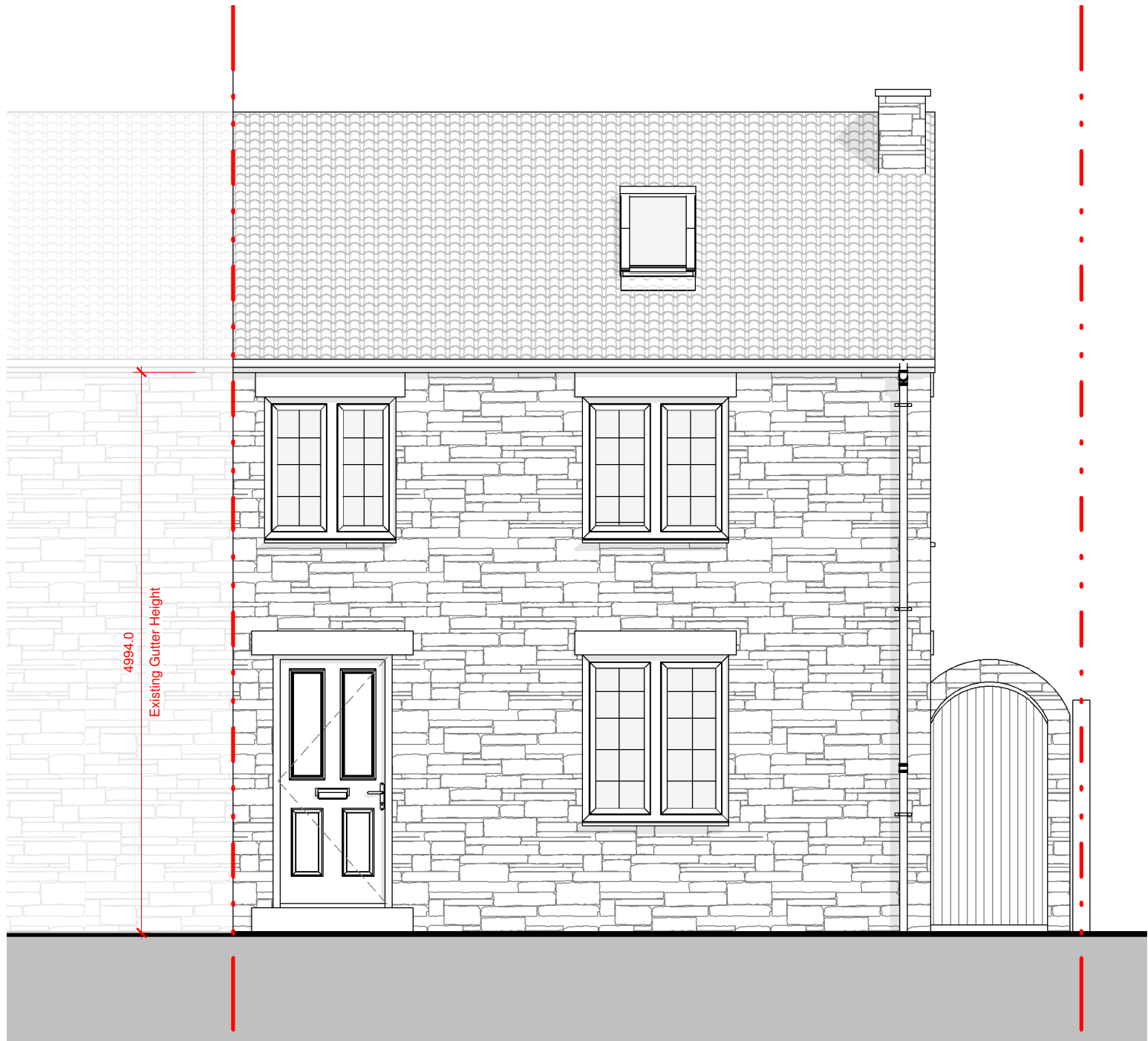
0.1 Existing Front Elevation