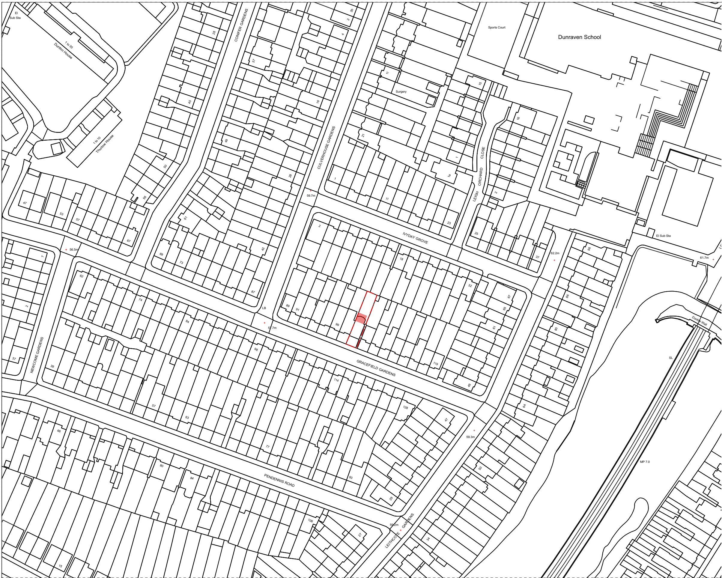
01 Location Plan [SCALE 1:1250 @ A1]

General Notes: Responsibility is not accepted for errors made by others in scaling from this drawing. All construction information should be taken from figured dimensions only. Unless noted otherwise all dimensions are in millimeters. All dimensions to be checked on site. These drawings are not for construction. Drawings to be read in conjunction with Structural Engineer's information and manufacturer's guidelines. Airtightness, damp proofing and weatherproofing are the responsibility of the Contractor unless stated otherwise. Membranes may not be shown at this scale, for the graphic clarity of the drawing.