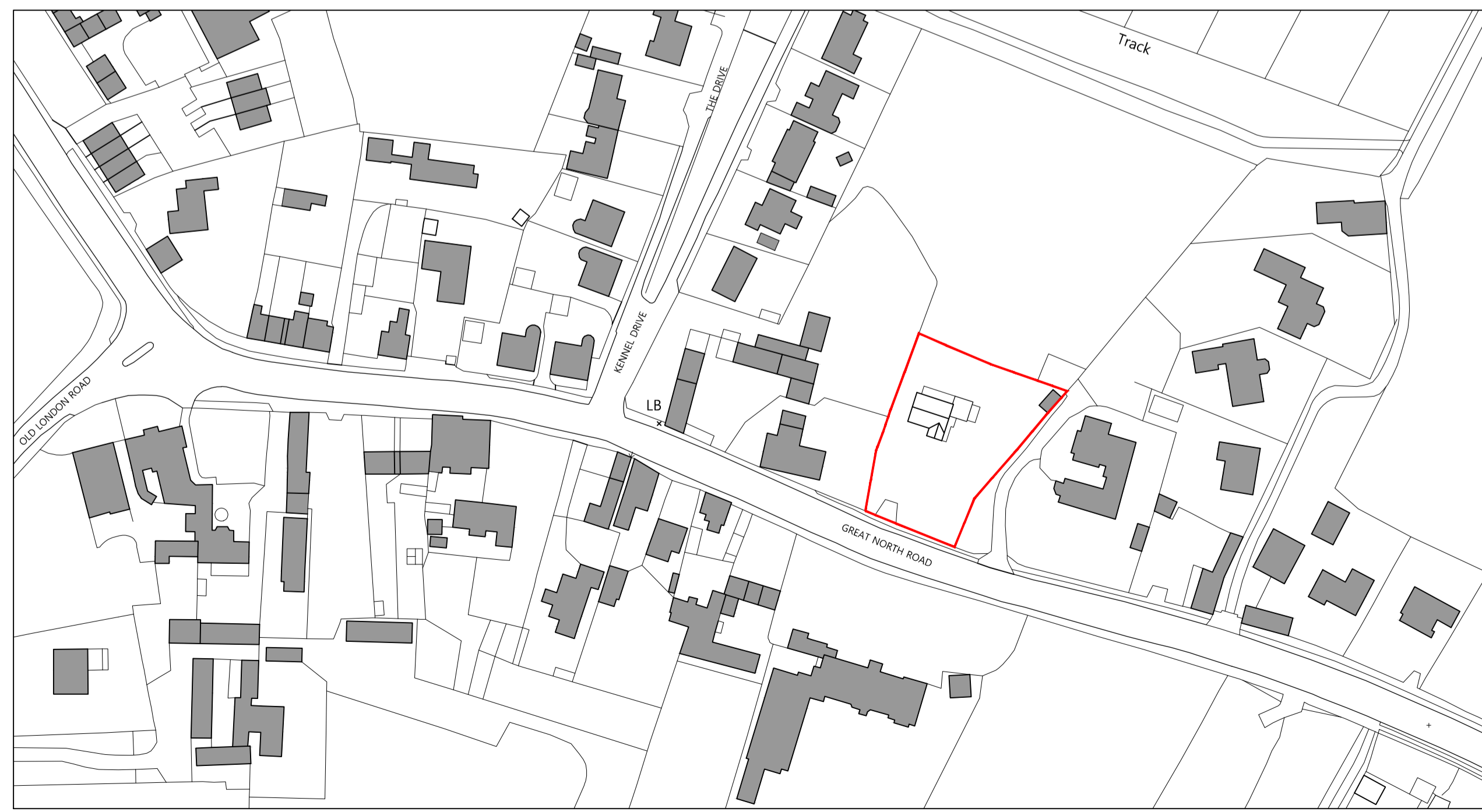
Site Location Plan (1:1250@A1)

OVERALL SITE AREA: 1850m 2 PROPOSED GROUND FLOOR GIA : 195m 2 PROPOSED FIRST FLOOR GIA: 130m 2