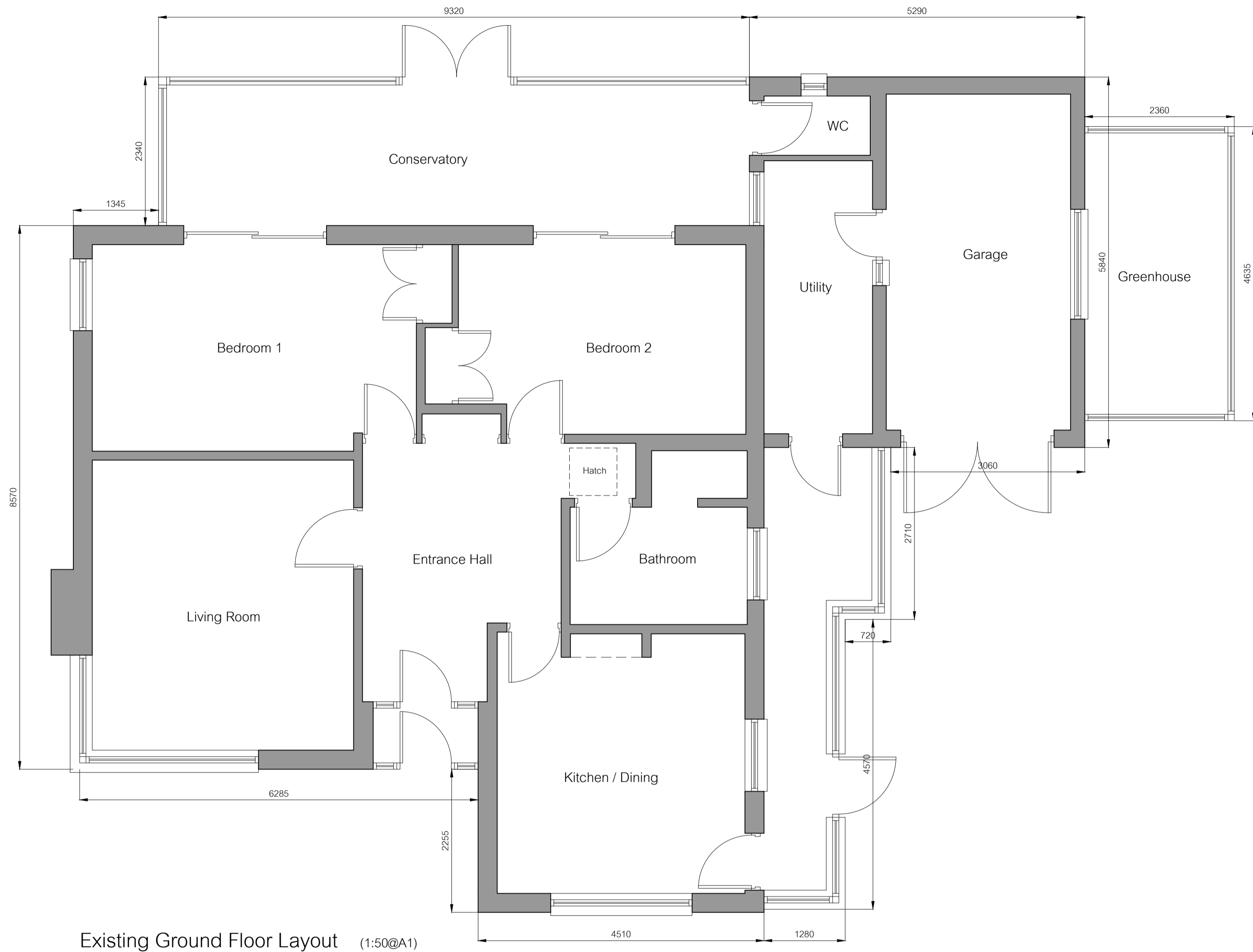
Existing Ground Floor Layout (1:50@A1)