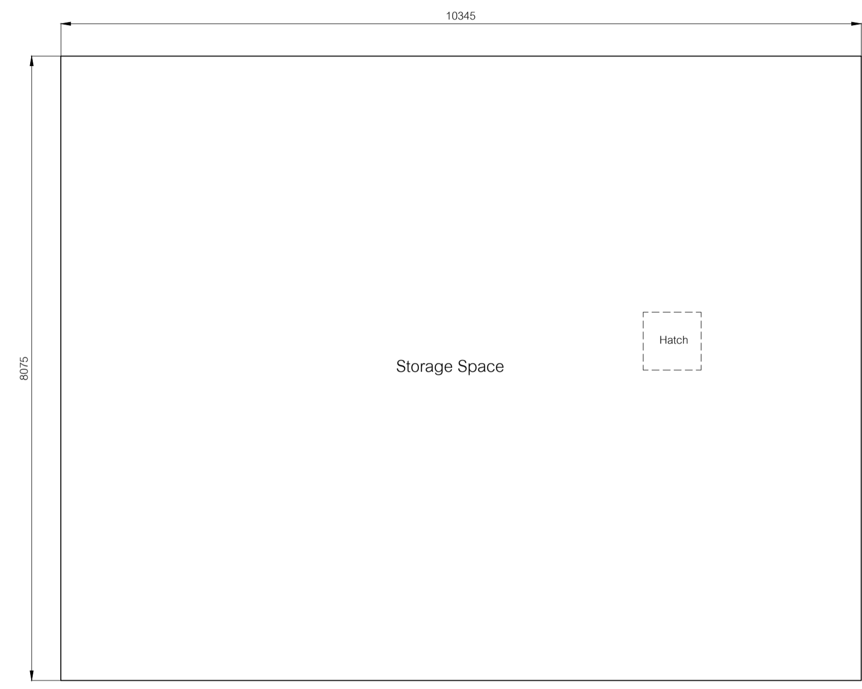
Existing First Floor Layout (1:50@A1)