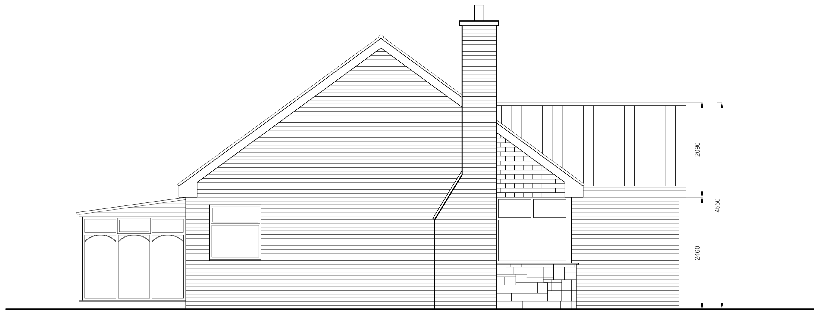
Existing Side Elevation (1:50@A1)