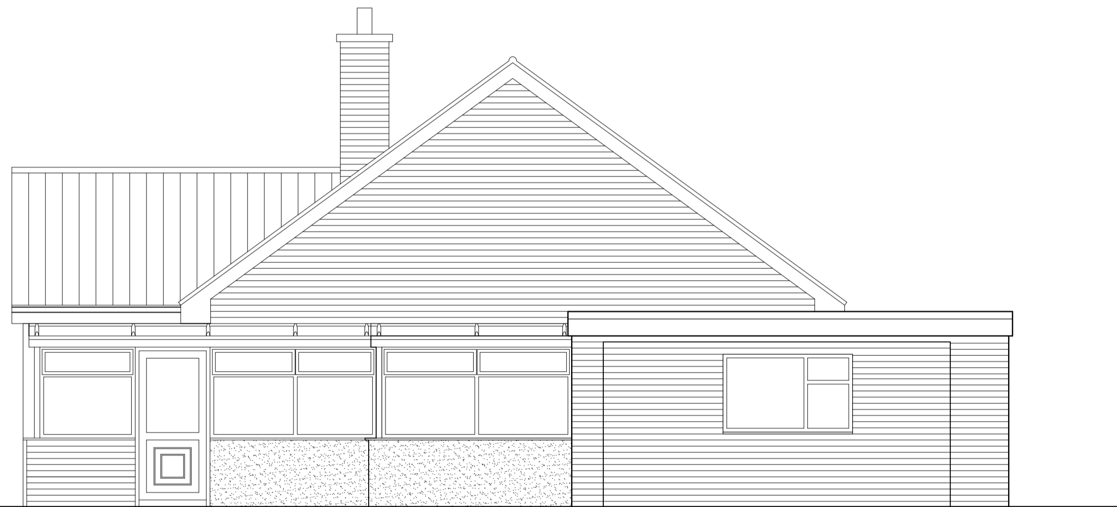
Existing Side Elevation (1:50@A1)