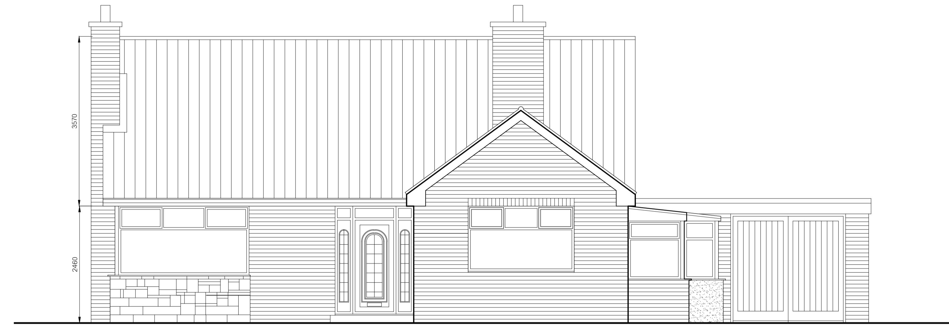
Existing Front Elevation (1:50@A1)