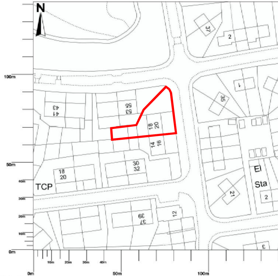
Scale 1:1250 LOCATION PLAN

Building (Scotland) Act 2003 note should be made that the relevant person / owner shall be responsible for signing and issuing the completion certificate application to the verifier. The relevant person shall also be responsible for the building standards CNP (Construction Notification Plan)