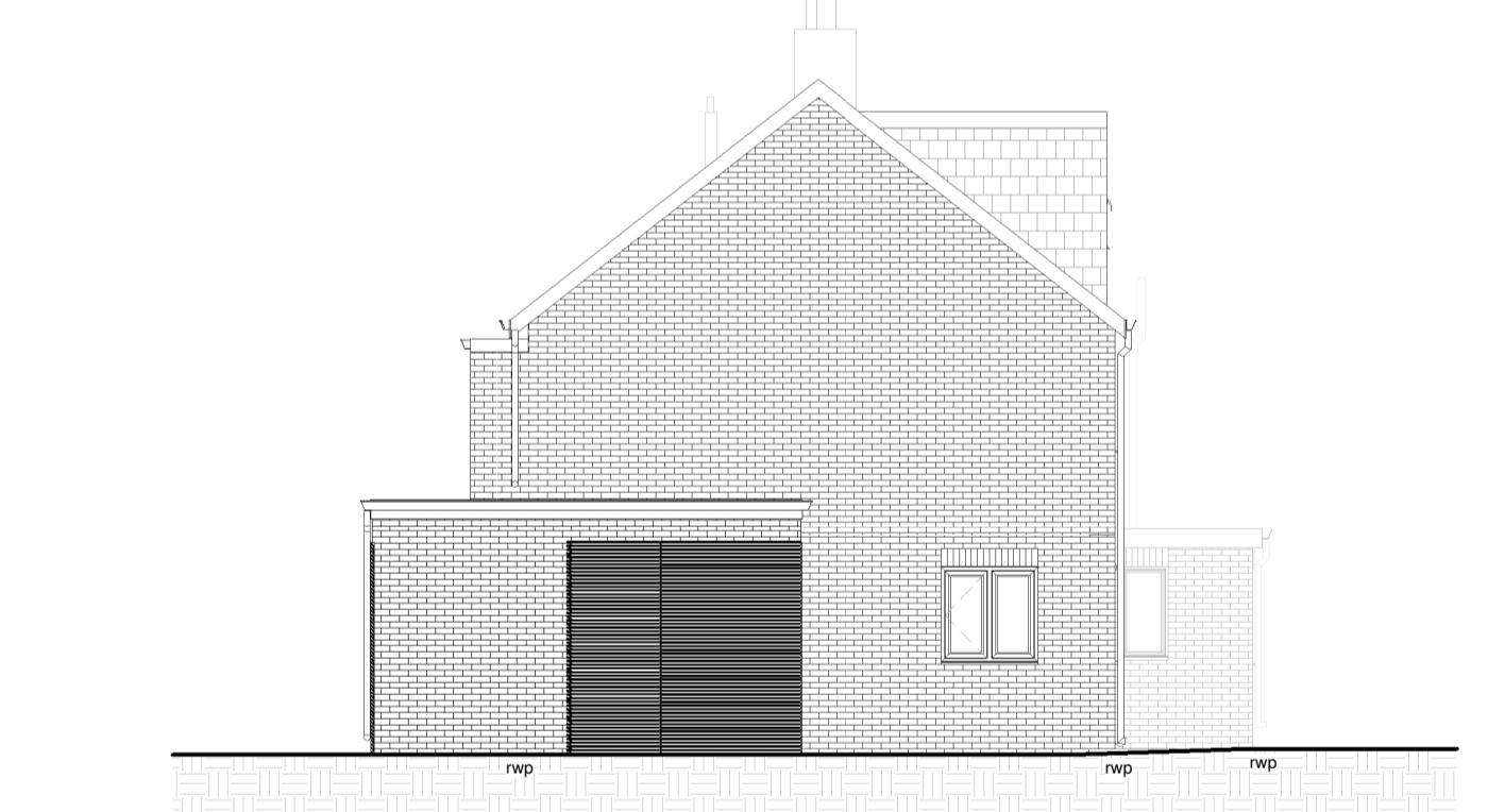
East 1 : 100