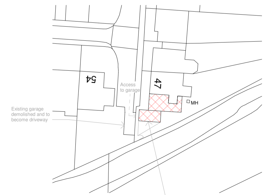
Site Plan 1 : 500