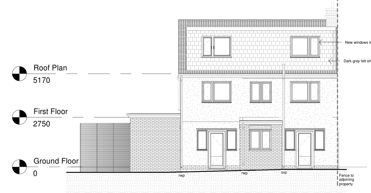
North 1 : 100