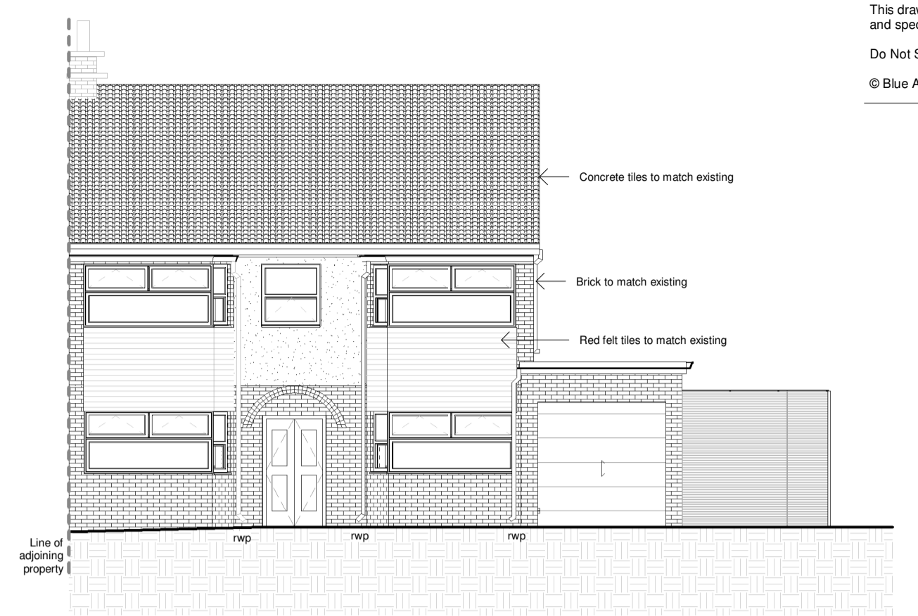
South 1 : 100