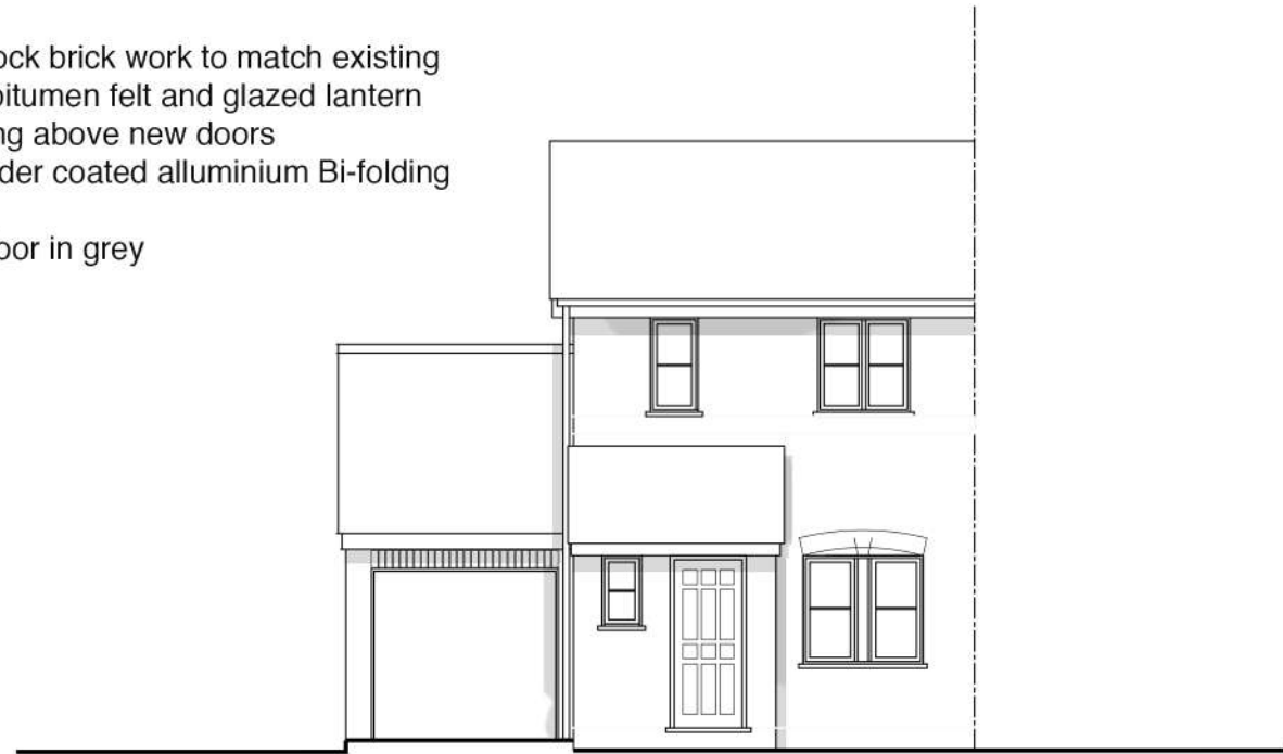
Proposed South-East Elevations - Scale 1:00