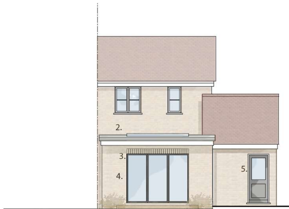
Proposed North-West Elevations - Scale 1:00