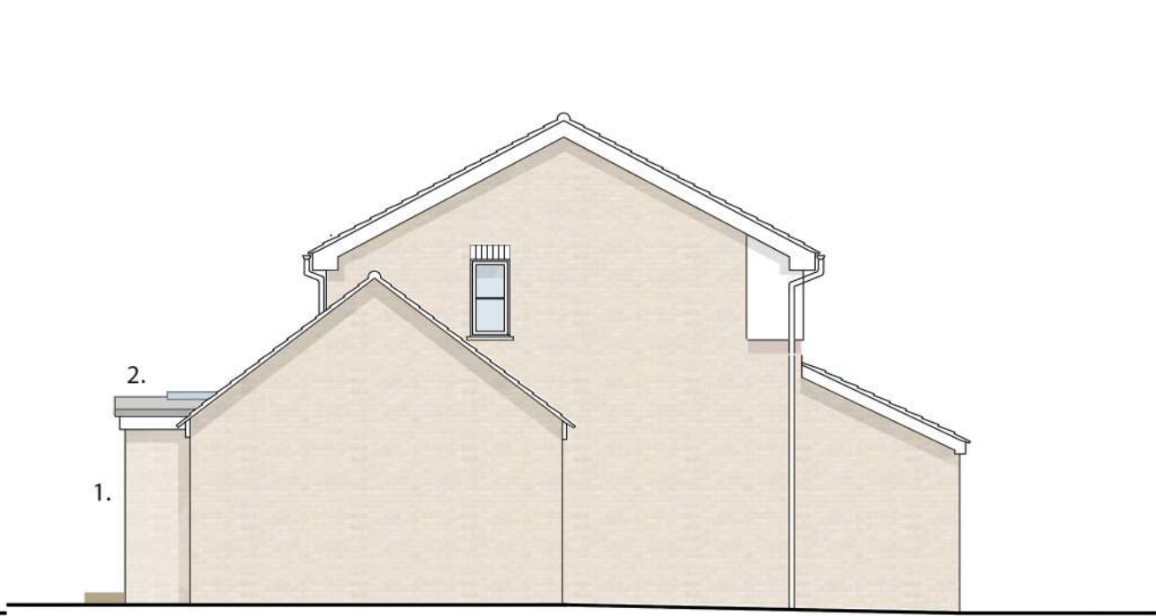
Proposed South-West Elevations - Scale 1:00