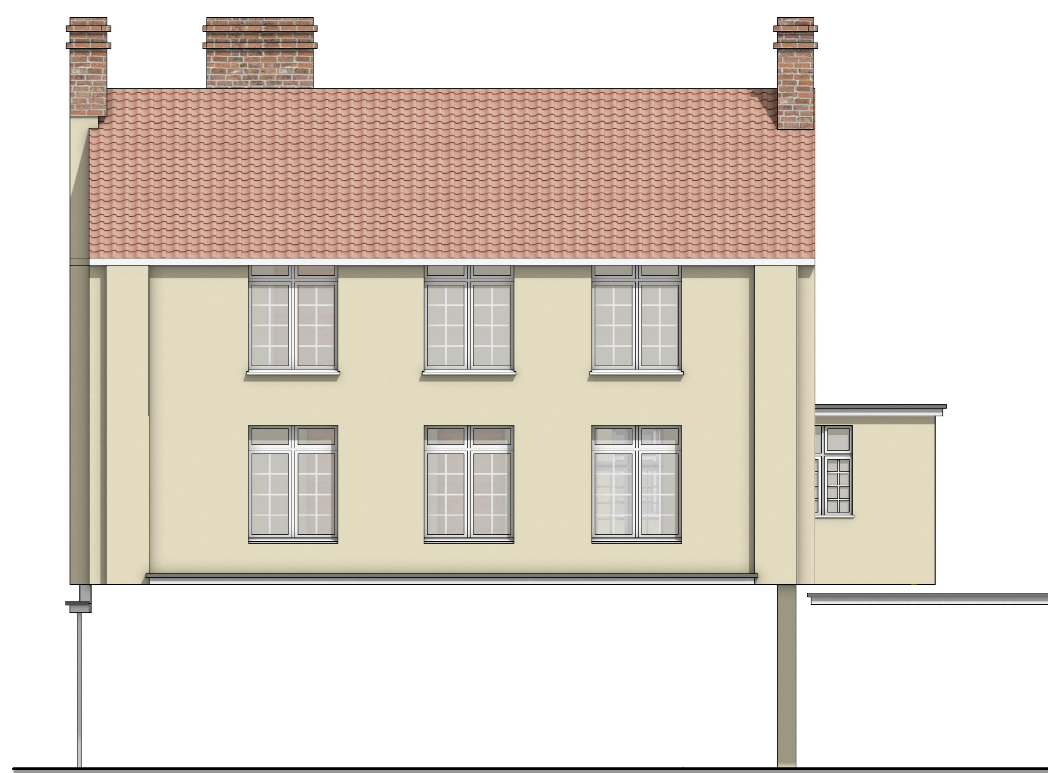
WEST ELEVATION 1:50