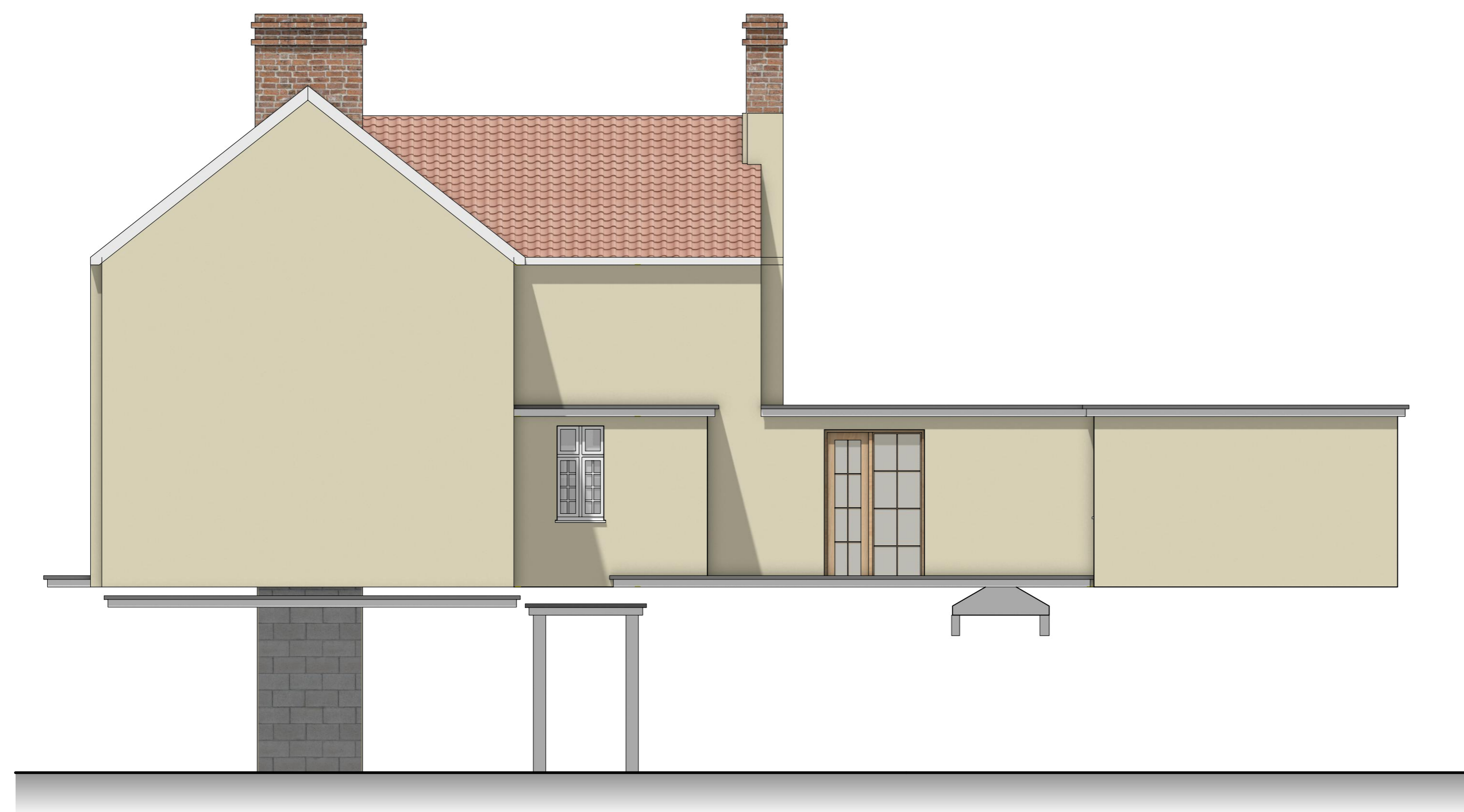
SOUTH ELEVATION 1:50