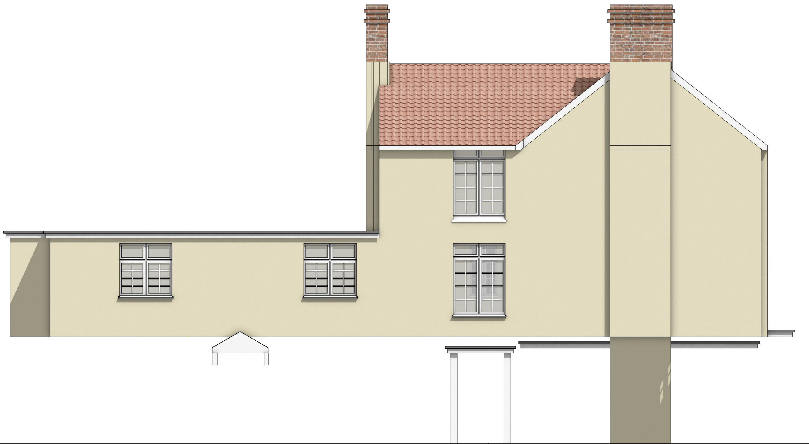
NORTH ELEVATION 1:50