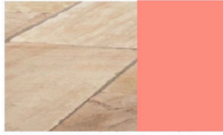
Buff Indian Paving for private patios