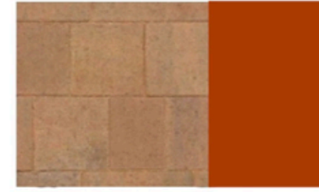
Brick sets for private parking areas