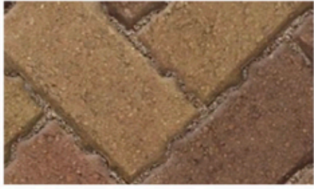
Brick pavers for shared surfaces