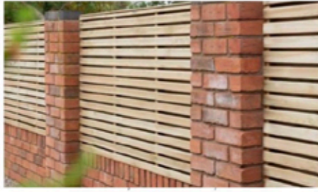
Horizontal fencing with brick piers and base