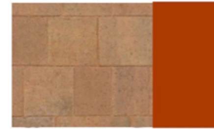
Brick setts for private parking areas