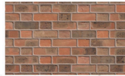
Flemish bond brick wall at entrance