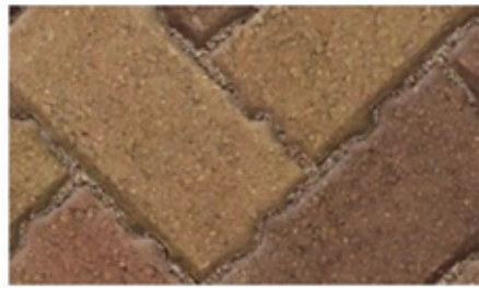
Brick pavers for shared surfaces