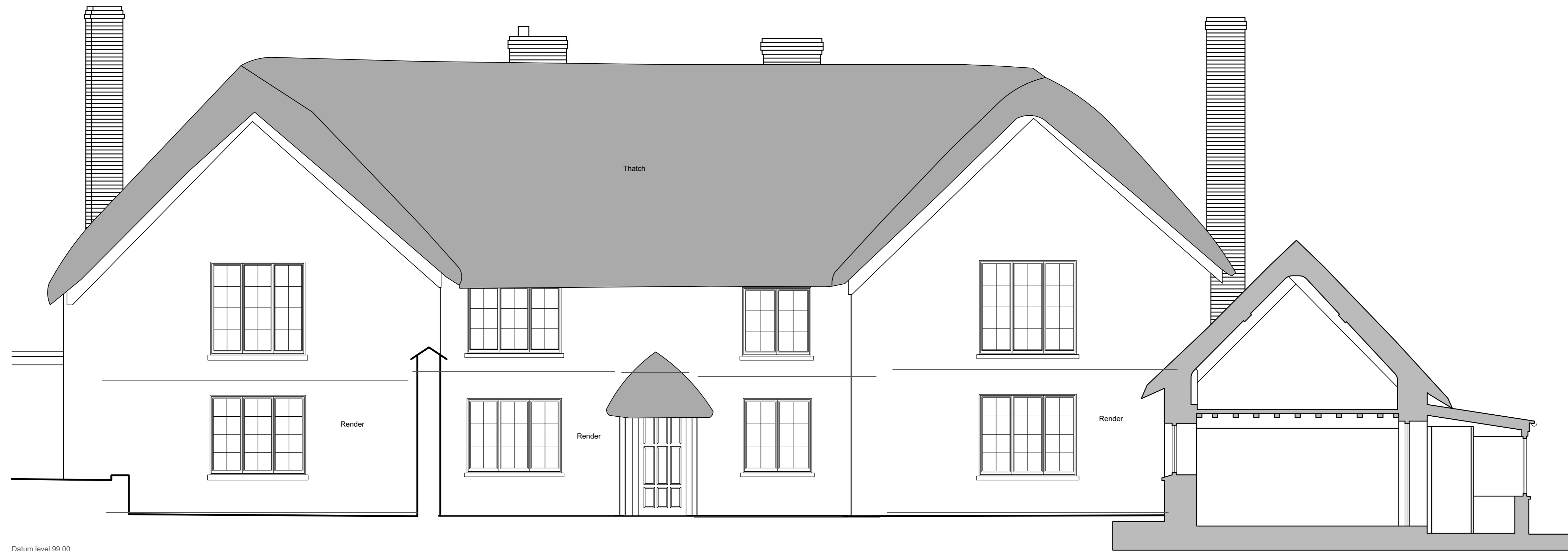
Datum level 99.00 SECTION B-B