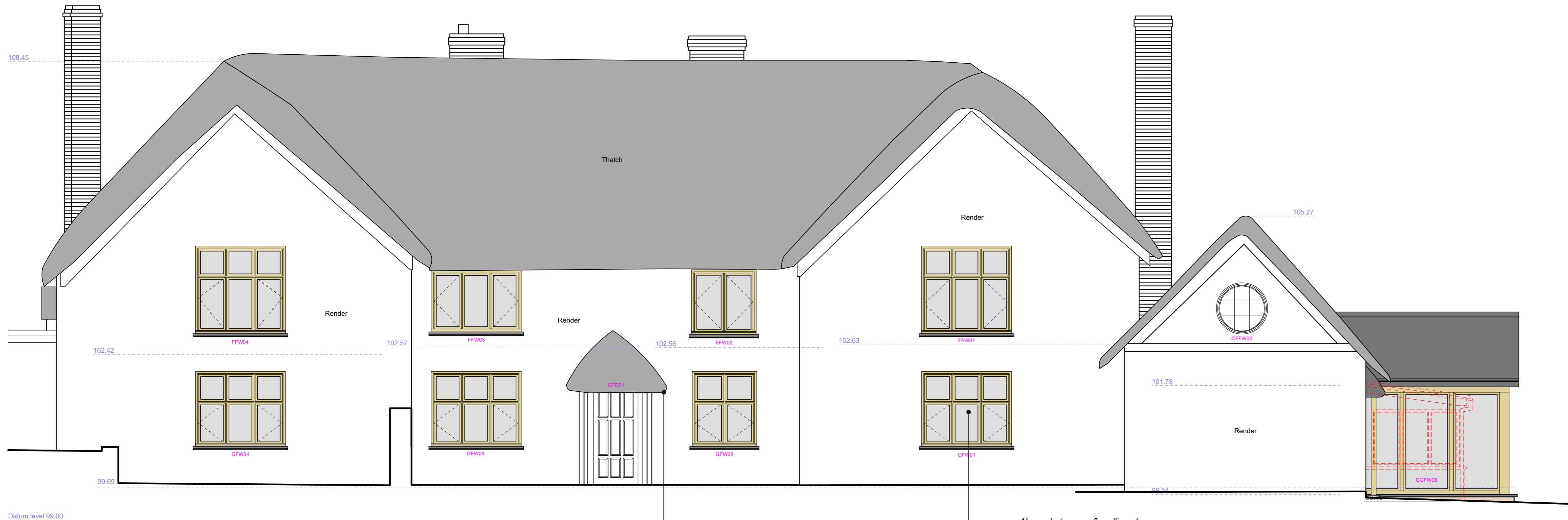
Proposed South-West Elevation 1:50@A1, 1:100@A3

Existing front door, porch and canopy retained and repaired New oak, transom & mullioned windows to all elevations as detail with 'heritage' double glazed casements & slate subcills in existing openings.