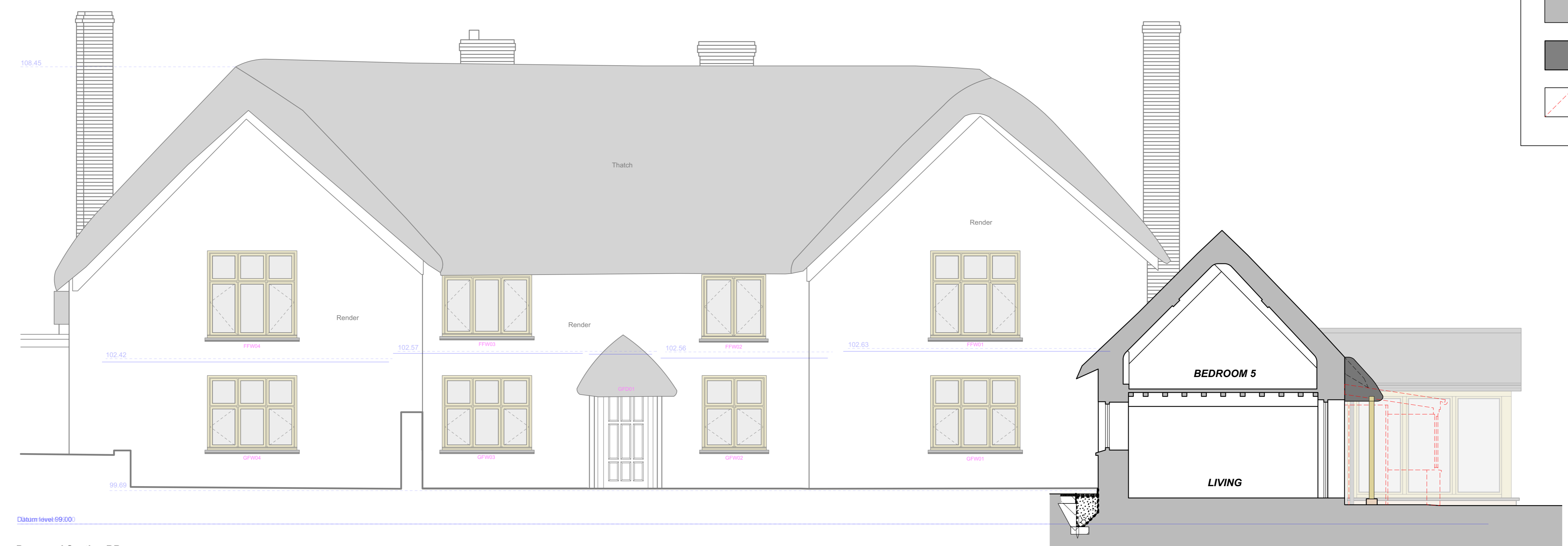
Proposed Section BB 1:50@A1, 1:100@A3