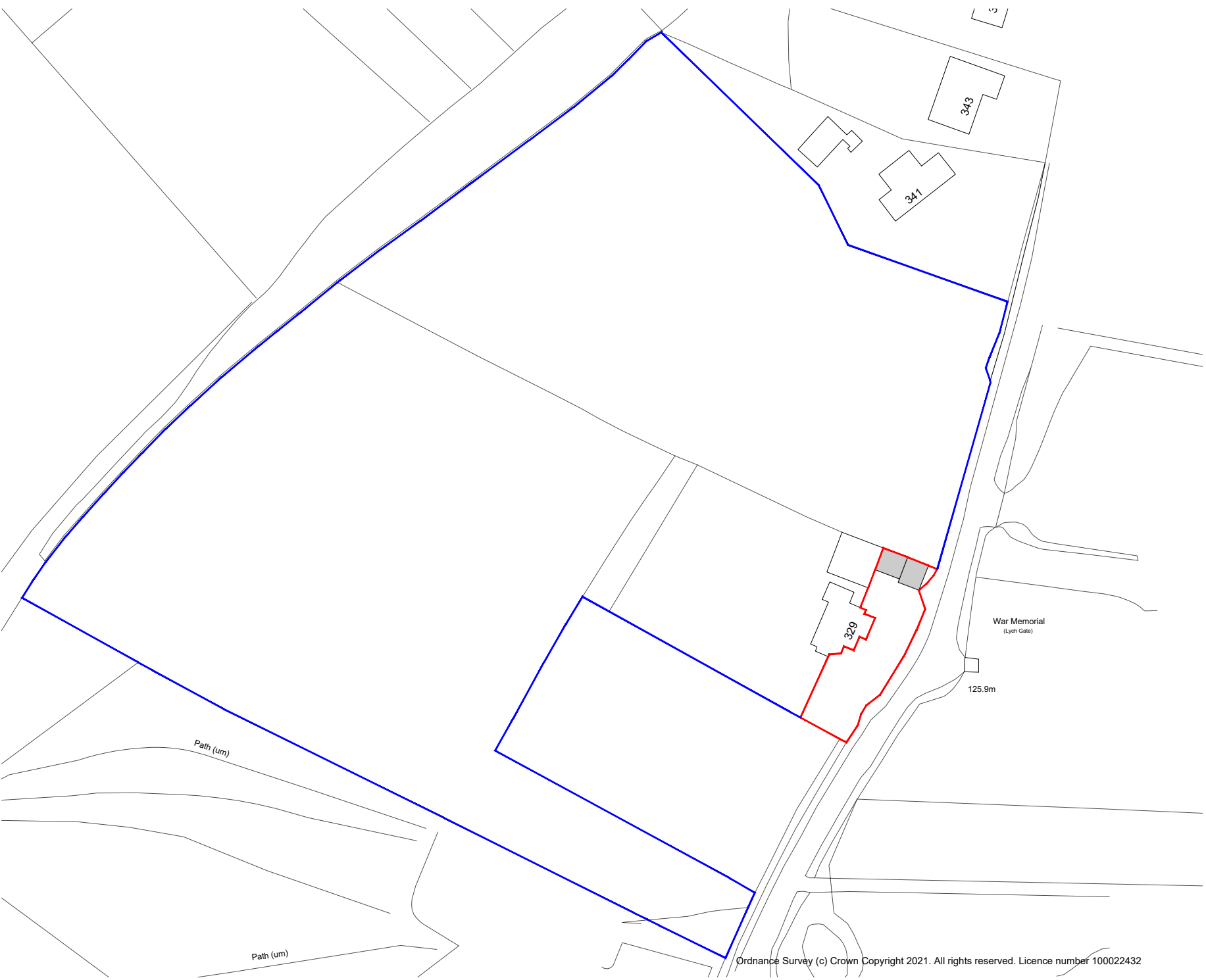
Existing Location Plan 1:1250