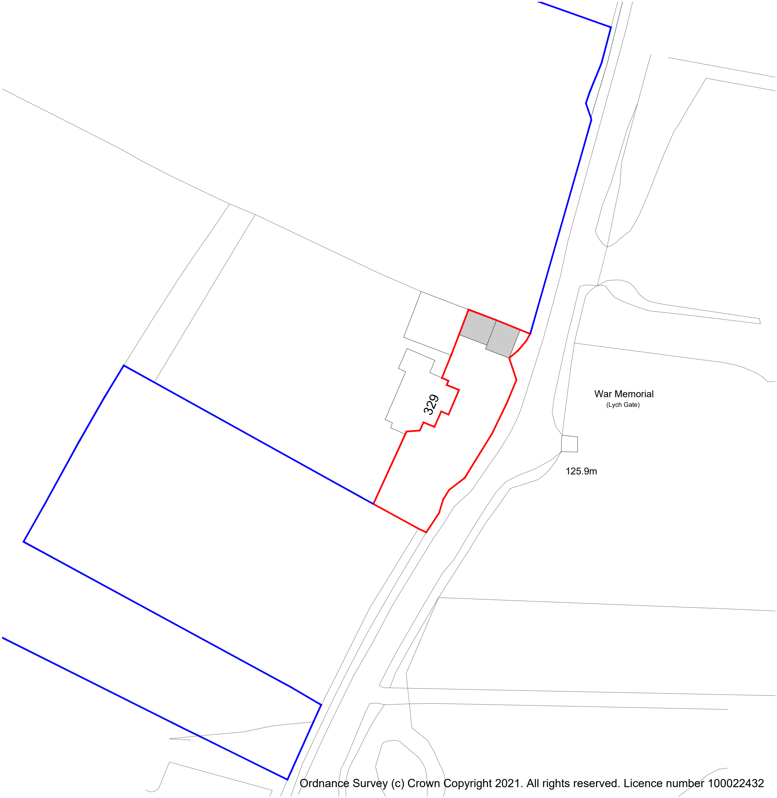
Existing Block Plan 1:500