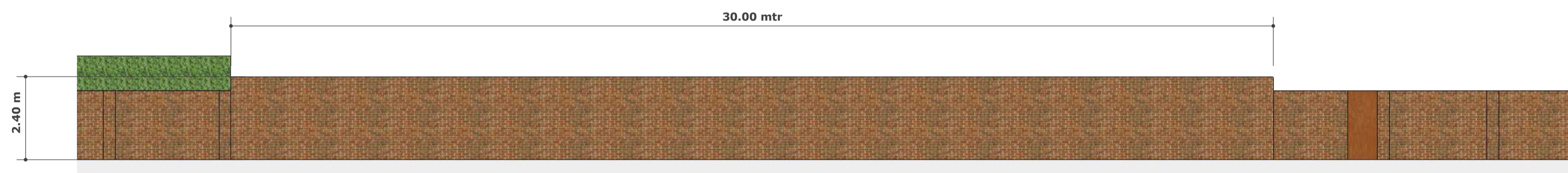
PROPOSED STREET VIEW