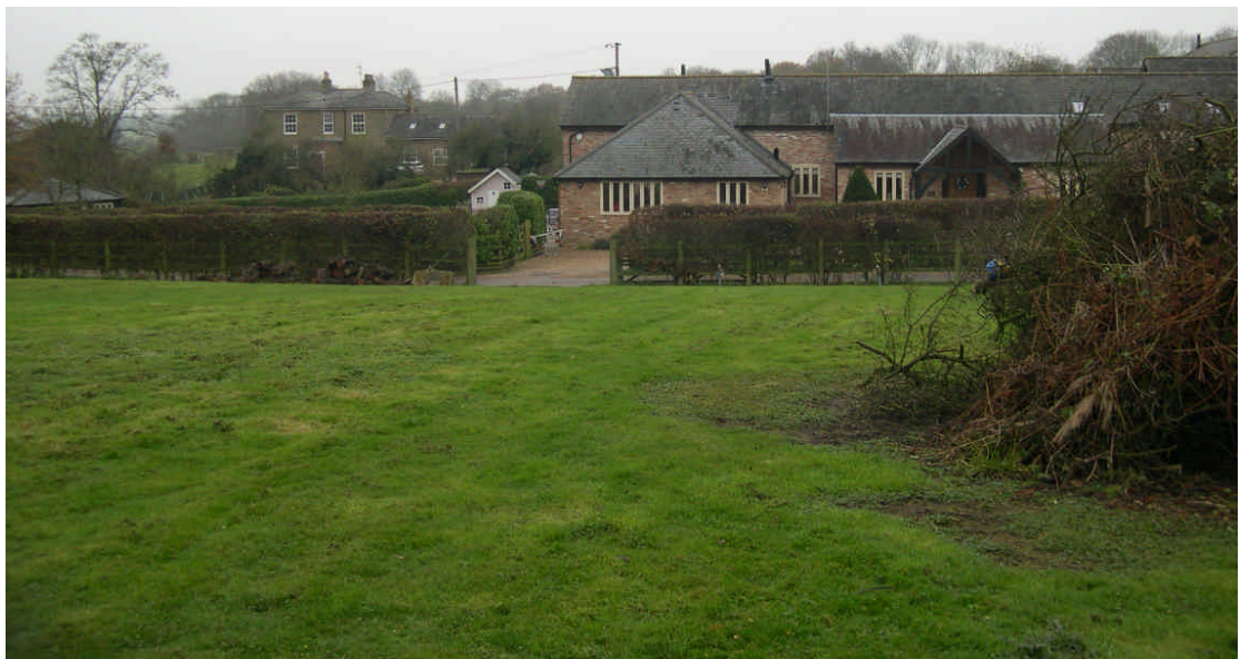
View from the field looking back at The Old Coach House.