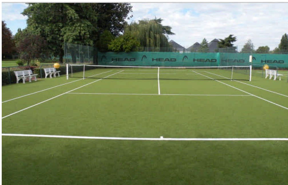
Synthetic grass tennis court with permanent white line markings.