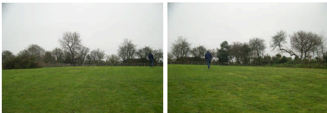
View of the northern boundary of the field and barn beyond.