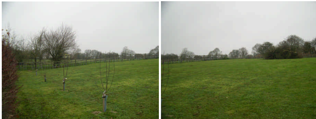
View of the western boundary of the field.

The existing opening in the hedge and fence beside the track will provide access to the tennis court, orchard and vegetable garden.