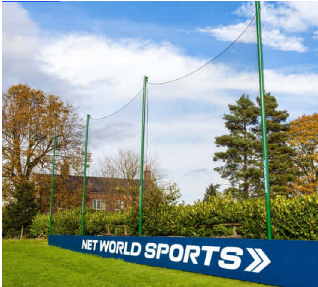
3 metre high light weight plastic netting raised up demountable posts to surround the tennis court.