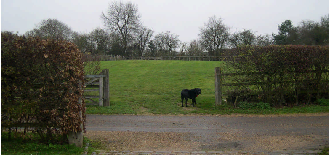
View of the field from the drive just outside the kitchen window of The Old Coach House.