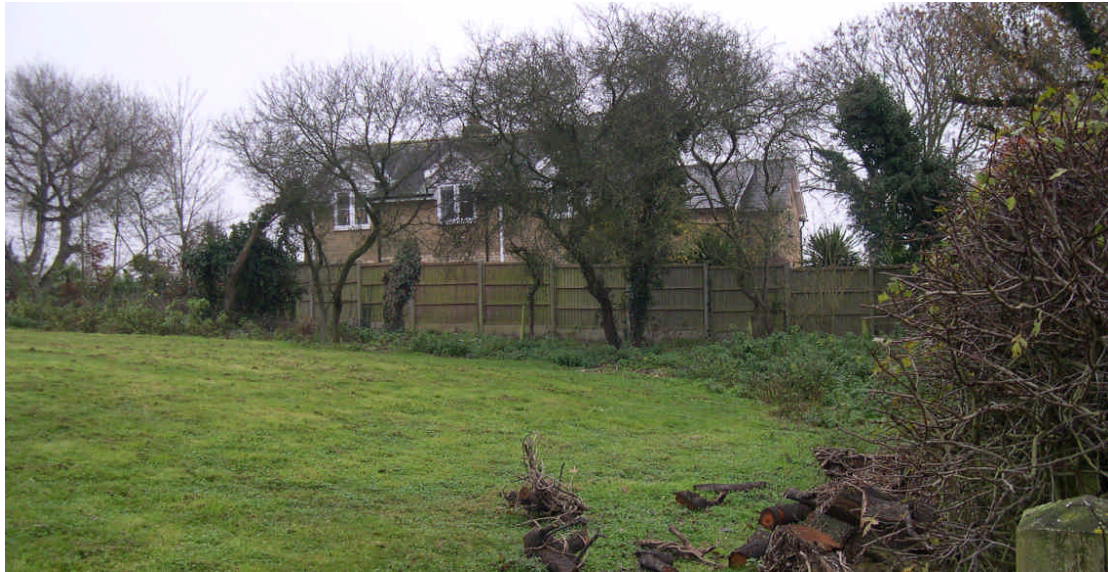
View of the side of Rickneys Cottage to the east of the field.