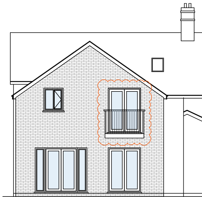
Proposed Rear Elevation Scale 1:100