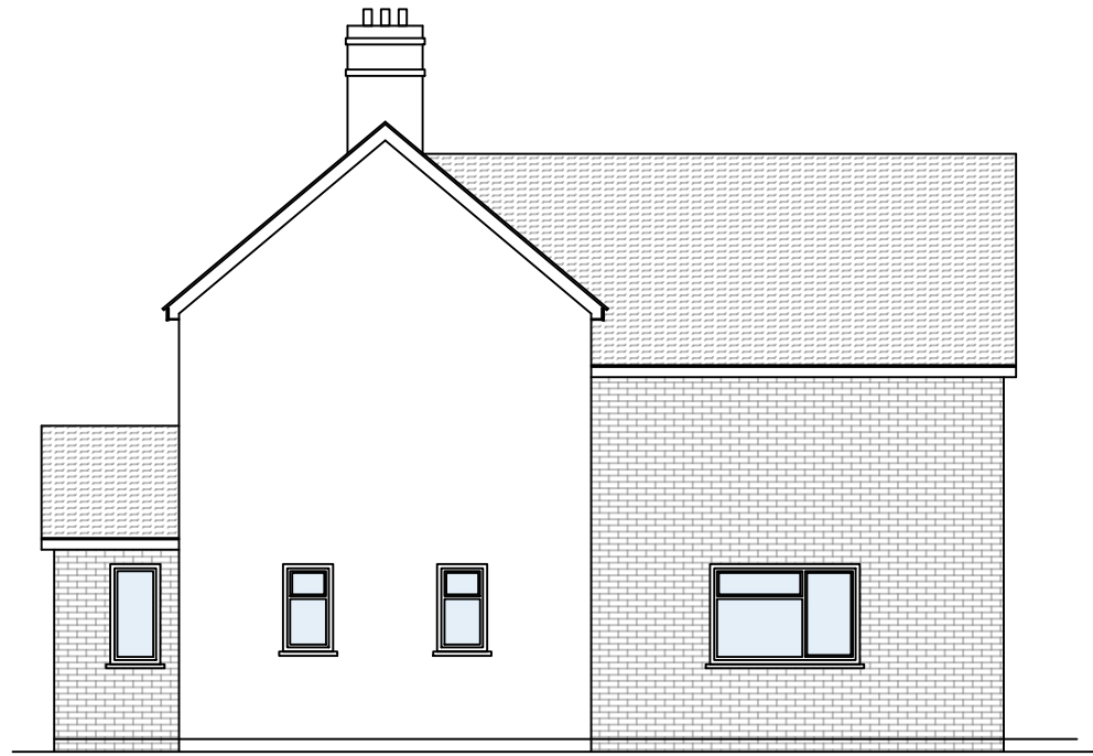
Proposed Side Elevation Scale 1:100