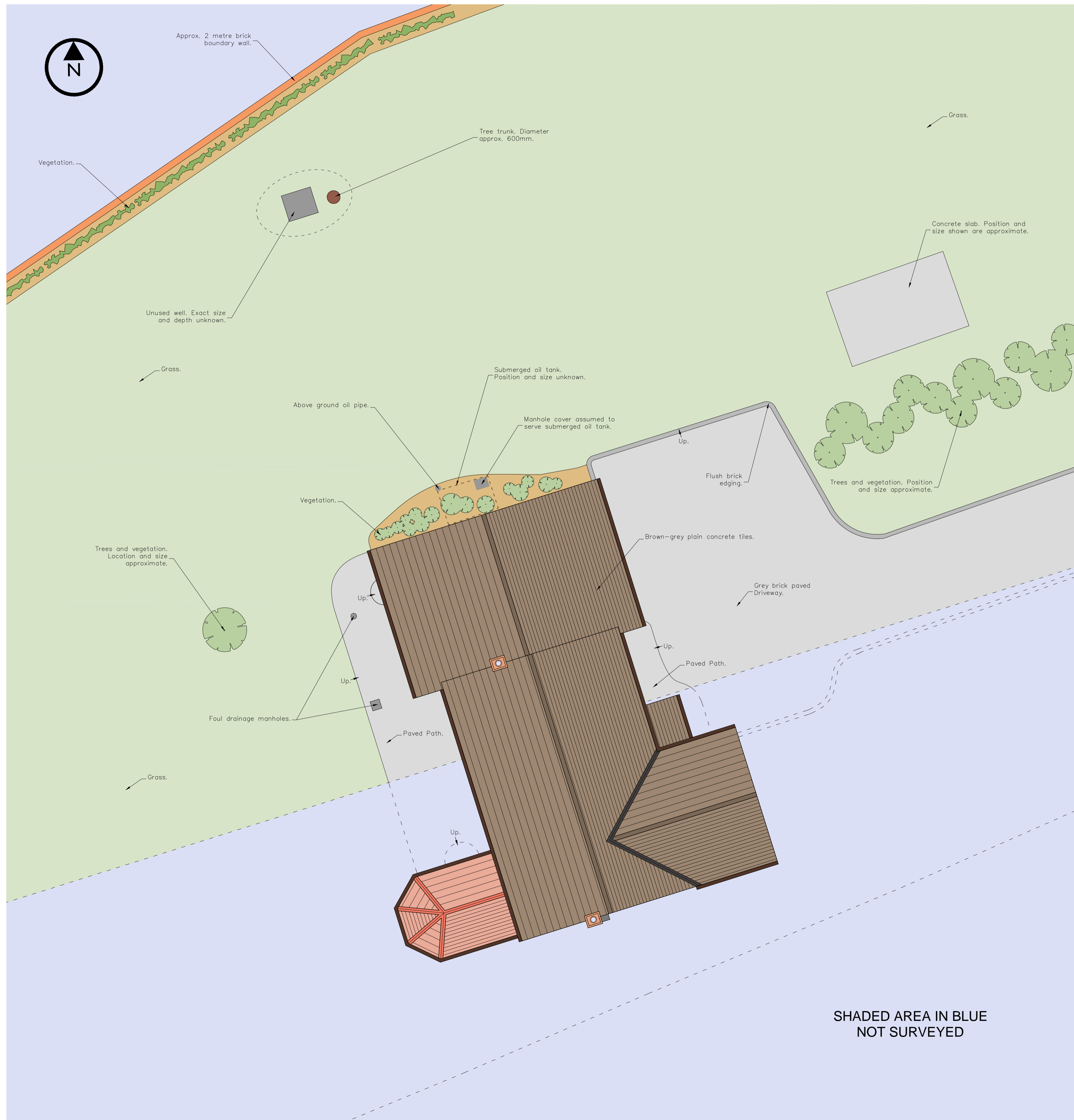
Existing Roof Plan Scale 1:100