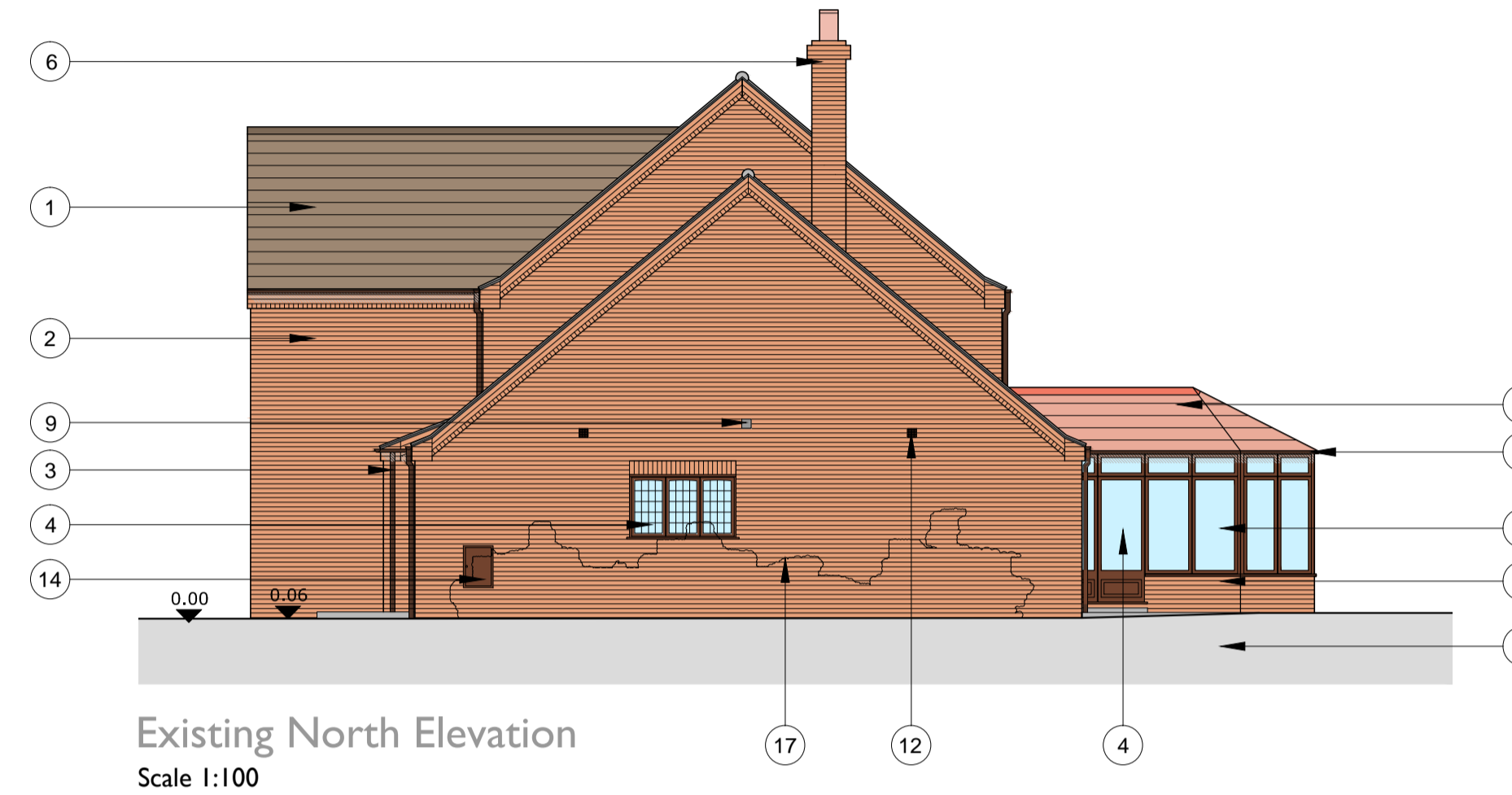
Existing North Elevation Scale 1:100