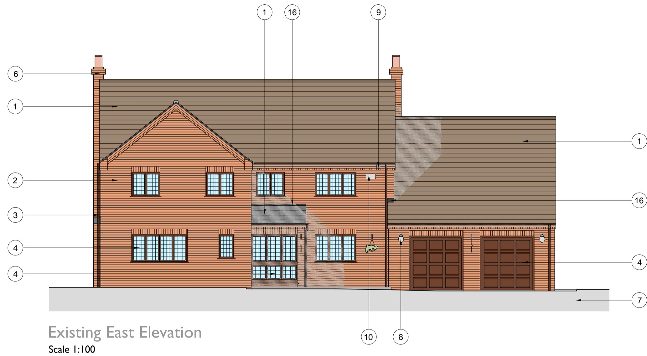
Existing East Elevation Scale 1:100