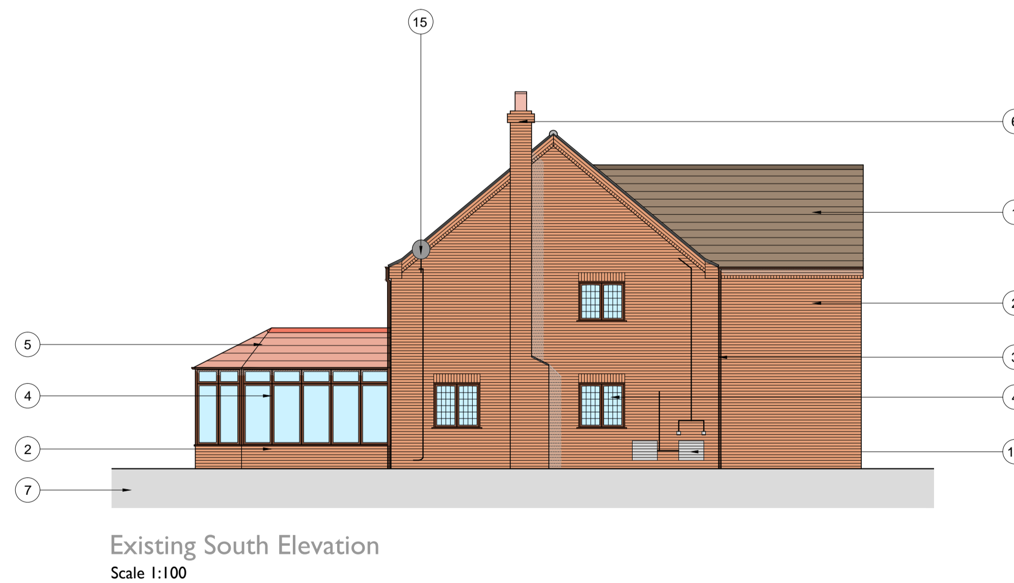
Existing South Elevation Scale 1:100

IMPORTANT INFORMATION THIS DRAWING MUST BE READ IN CONJUNCTION WITH ALL OTHER INFORMATION CONTAINED ON RUSSEN & TURNER DRAWINGS. THIS DRAWING MUST NOT BE REVIEWED IN ISOLATION. DIMENSIONS MUST NOT BE SCALED FROM THE DRAWINGS. ALL DIMENSIONS ARE APPROXIMATE. THIS DRAWING HAS BEEN PREPARED FOR DISCUSSION PURPOSES ONLY AND MUST NOT BE USED FOR CONSTRUCTION PURPOSES.