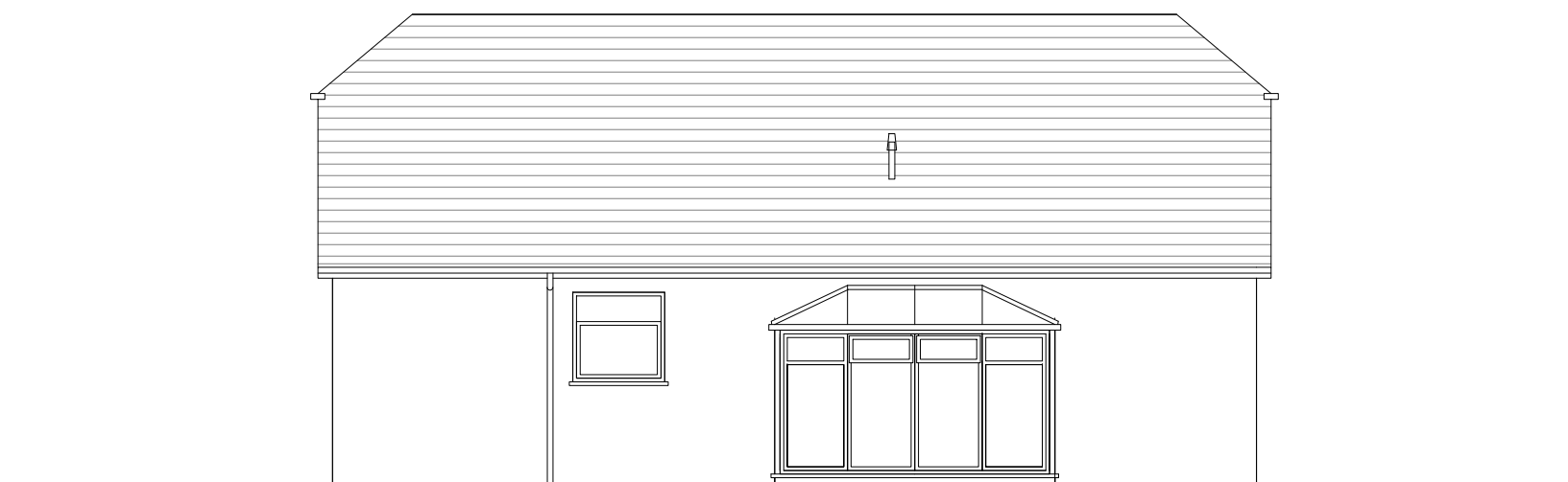
East Elevation (Scale 1:100)