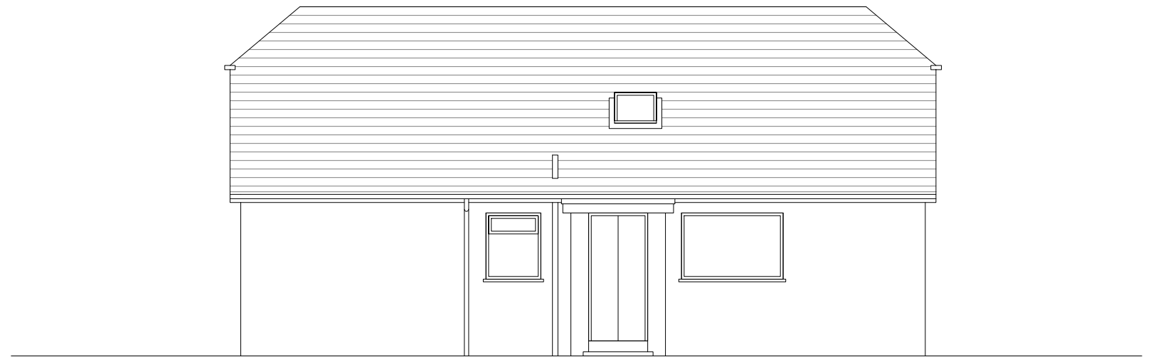
West Elevation (Scale 1:100)

NOTES DO NOT SCALE THIS DRAWING - WRITTEN DIMENSIONS ONLY TO BE FOLLOWED ALL DIMENSIONS SHOWN ARE IN MILLIMETRES ARCHITECTURAL DRAWINGS TO BE READ IN CONJUNCTION WITH ENGINEERING DRAWINGS WHERE APPLICABLE ANY DISCREPANCIES TO BE CLARIFIED PRIOR TO WORK START STUDIO TWO FIVE IS THE TRADING NAME OF MURRAY MACLEOD ASSOCIATES LTD