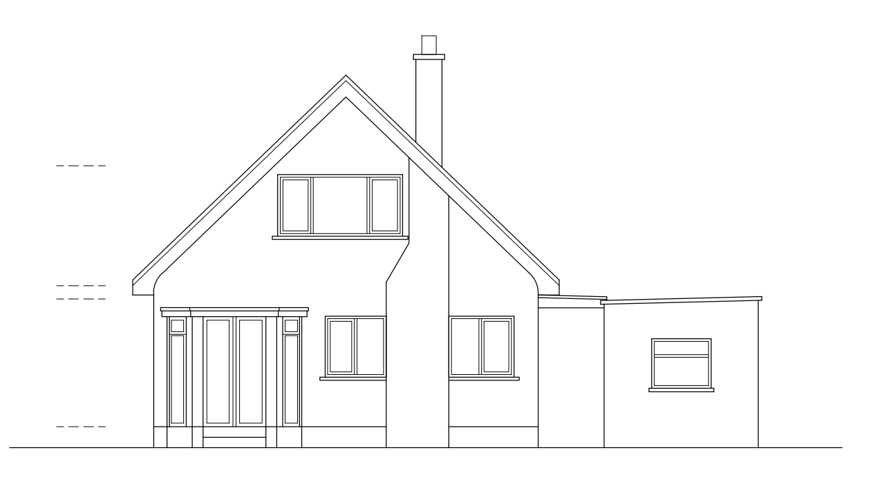
EXISTING SOUTH WEST ELEVATION SCALE 1:100 @ A1