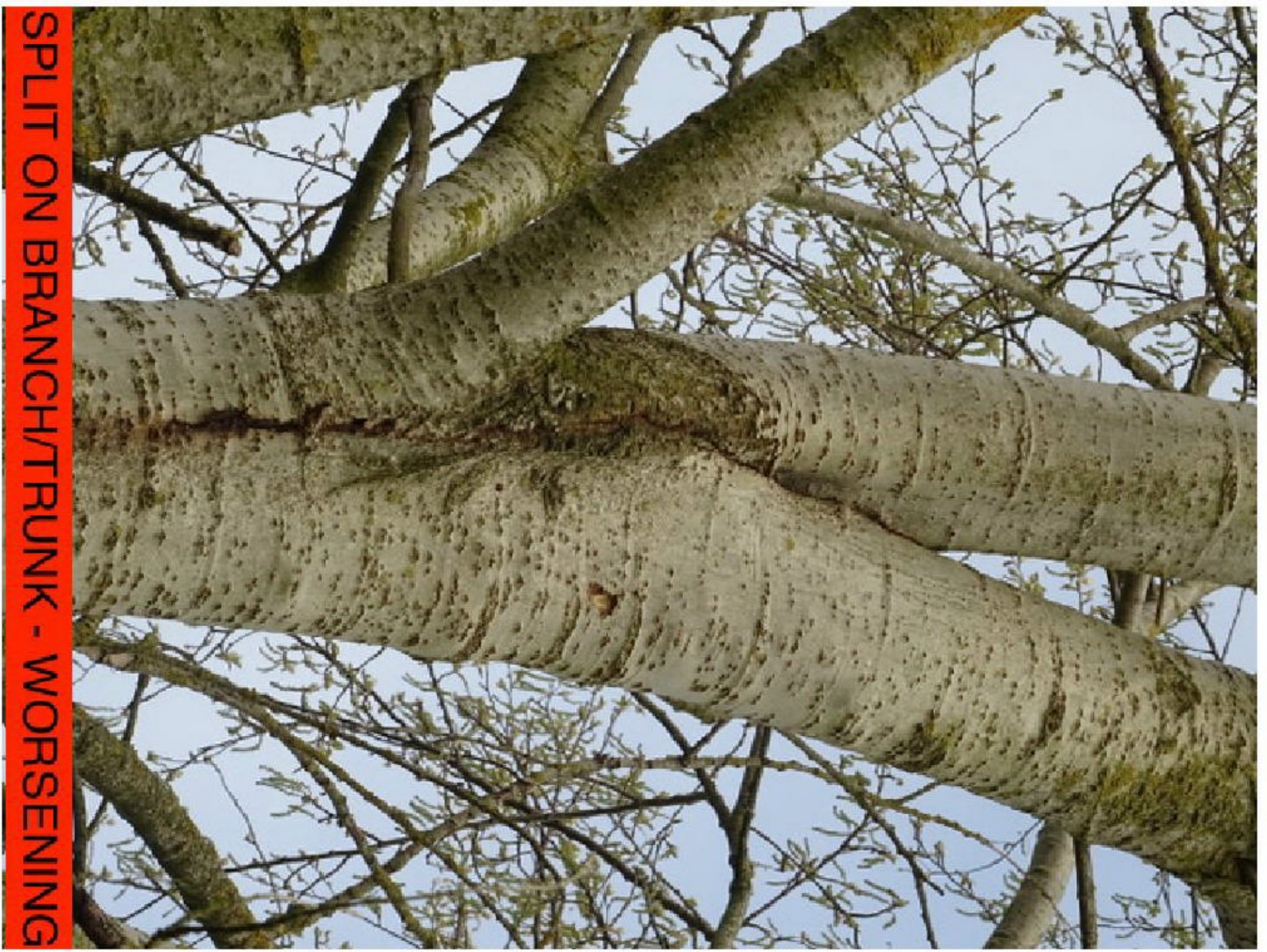
SPLIT ON BRANCH/TRUNK - WORSENING