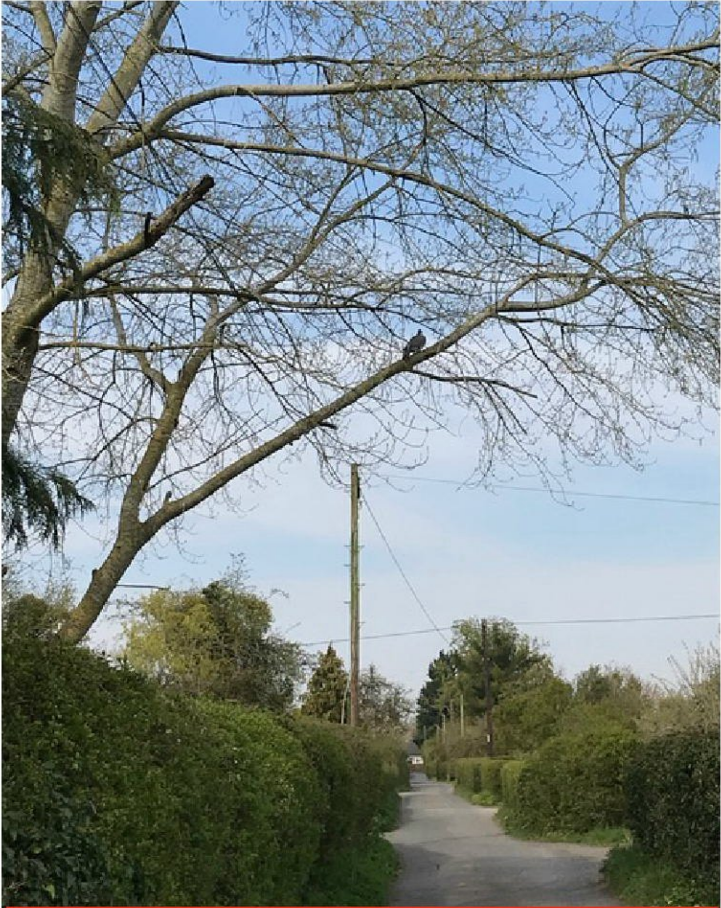
2. SHOWING OVERHANGING BRANCHES