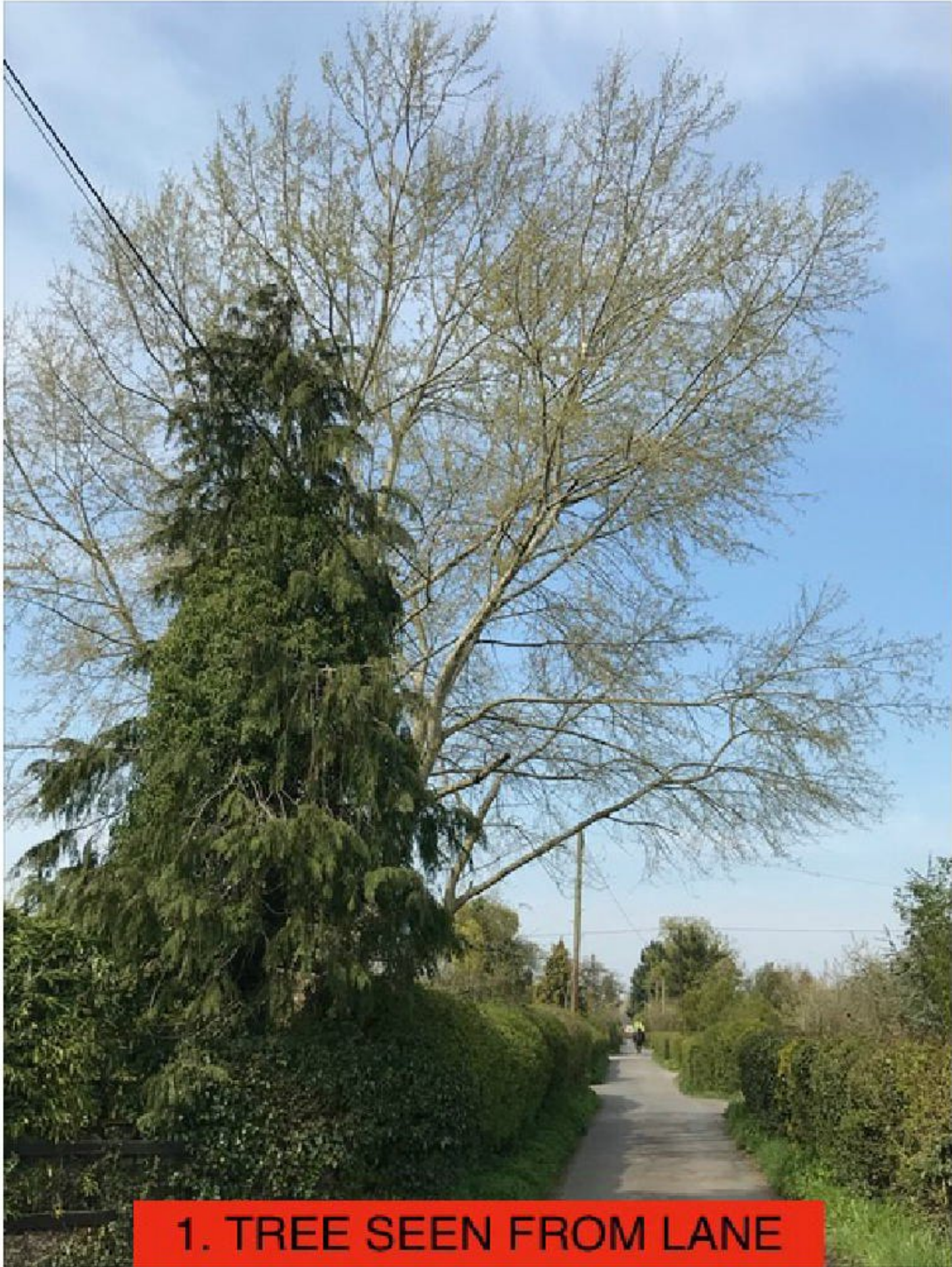
1. TREE SEEN FROM LANE