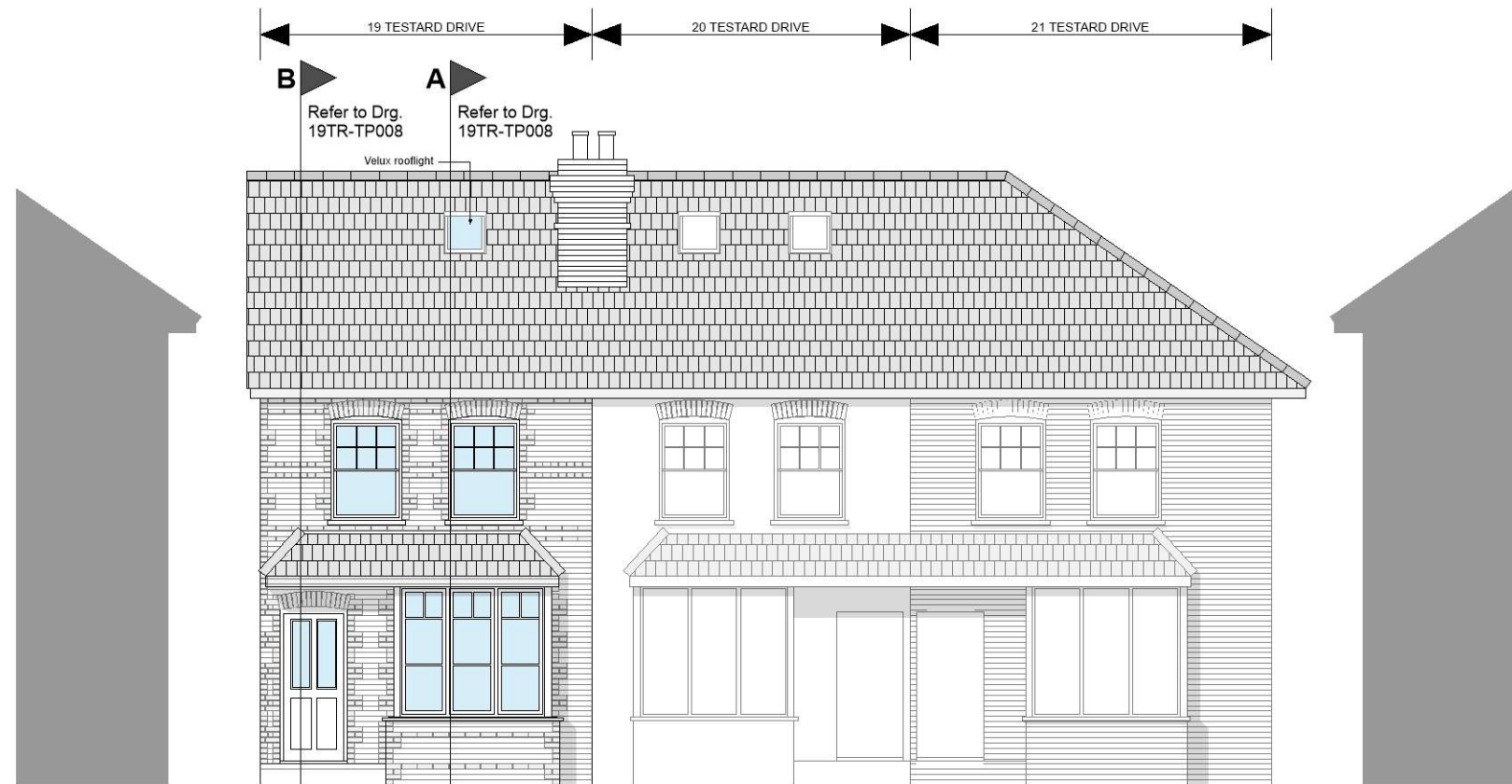
PROPOSED FRONT ELEVATION as viewed from Testard Road