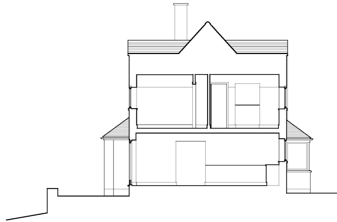
SECTION A - A