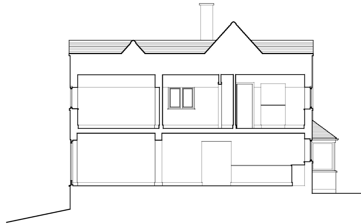
SECTION A - A