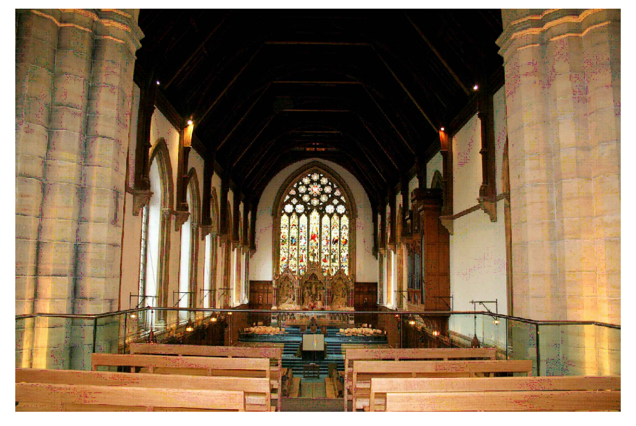
Example of Ion Glass balustrade system at Hurstpierpoint College Chapel