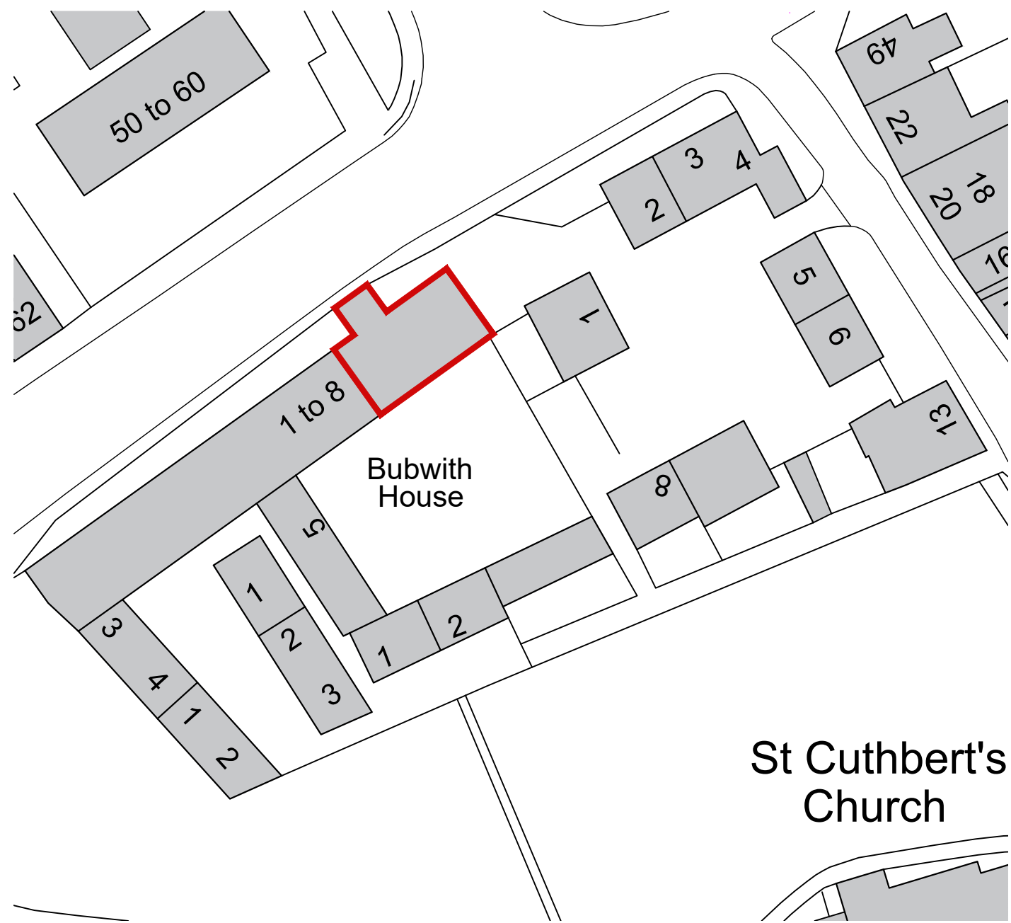
Block Plan 1:500 metres 10 20 30 40 50