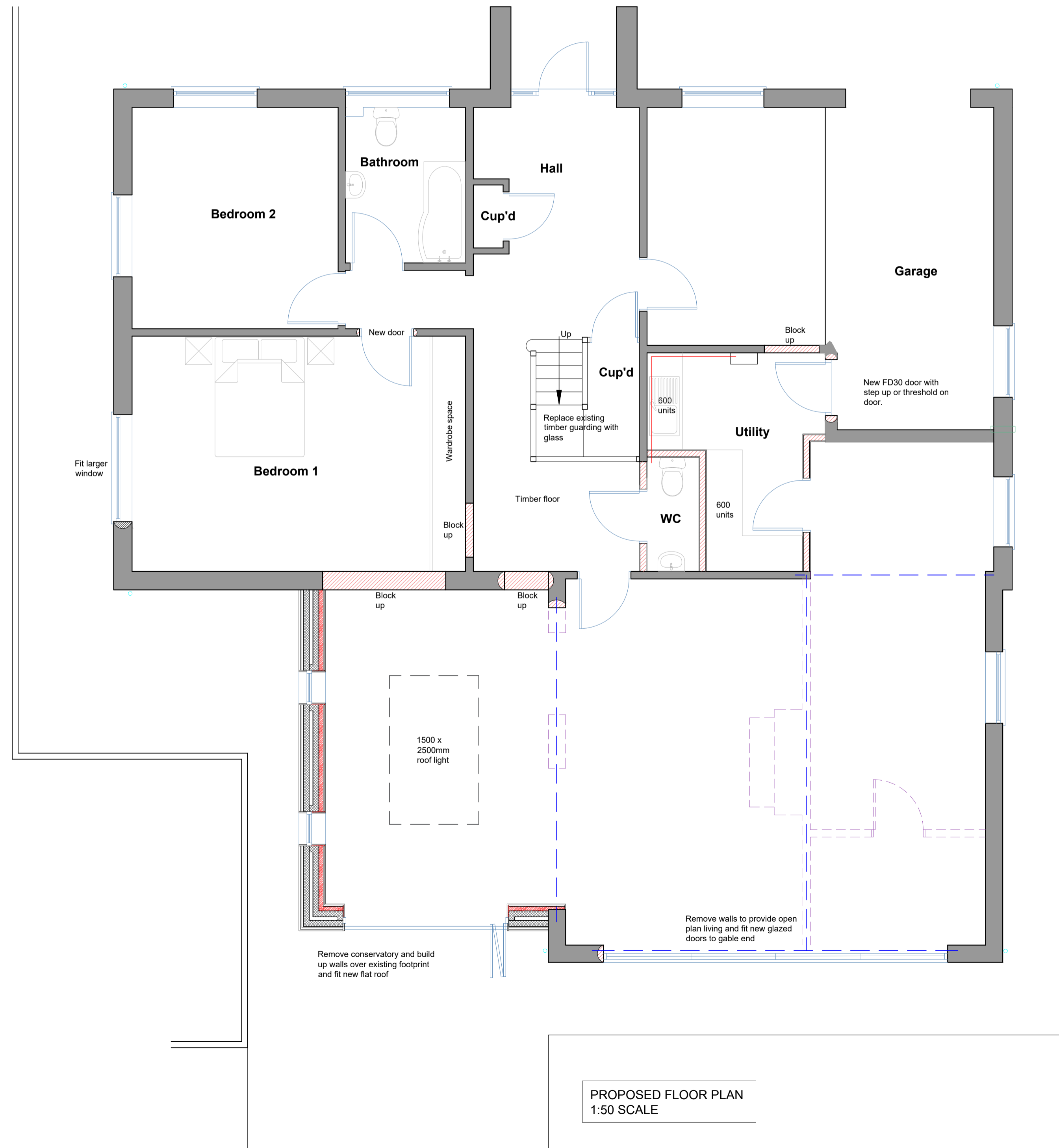
PROPOSED FLOOR PLAN 1:50 SCALE