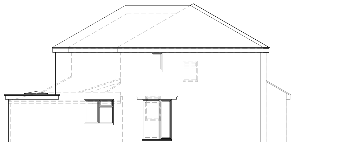
SIDE ELEVATION (Left)