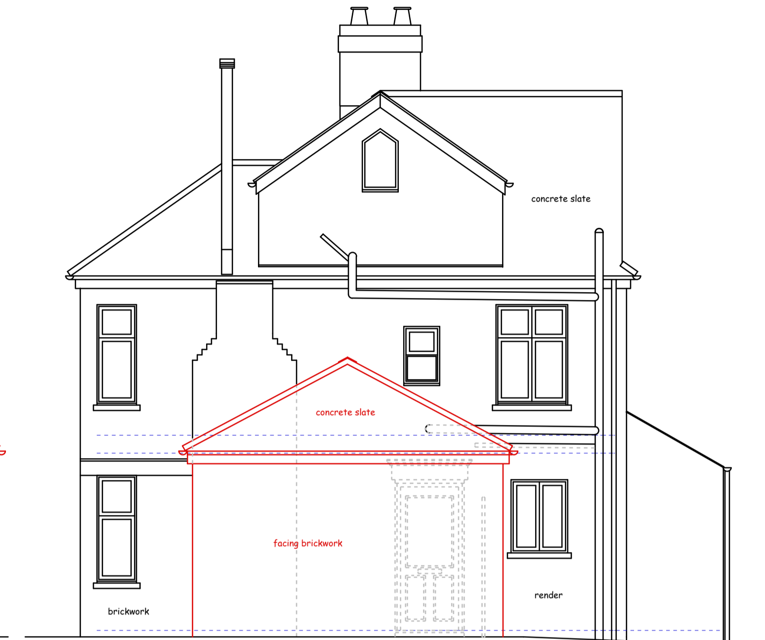
Proposed Side Elevation - 1 : 50