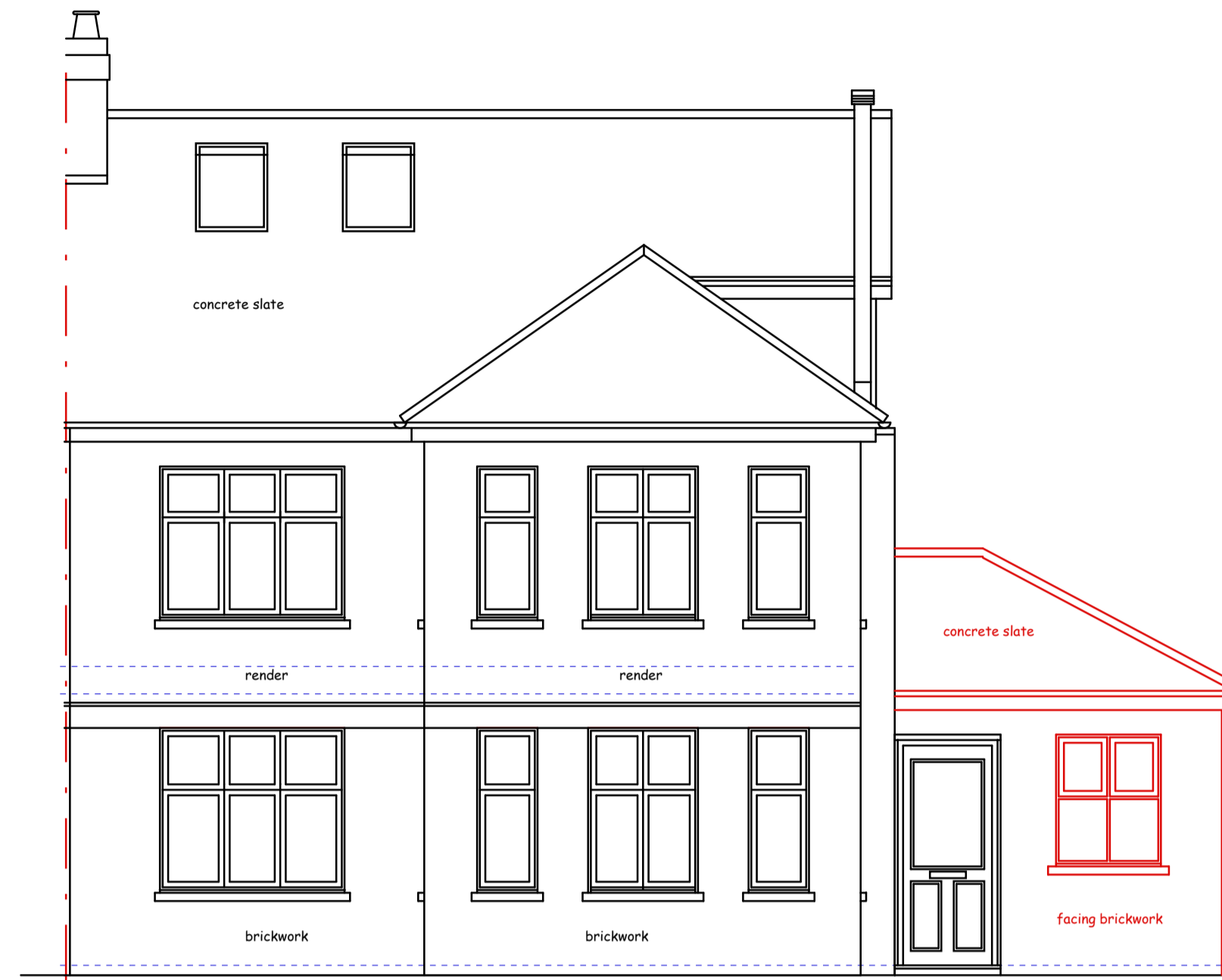
Proposed Front Elevation - 1 : 50