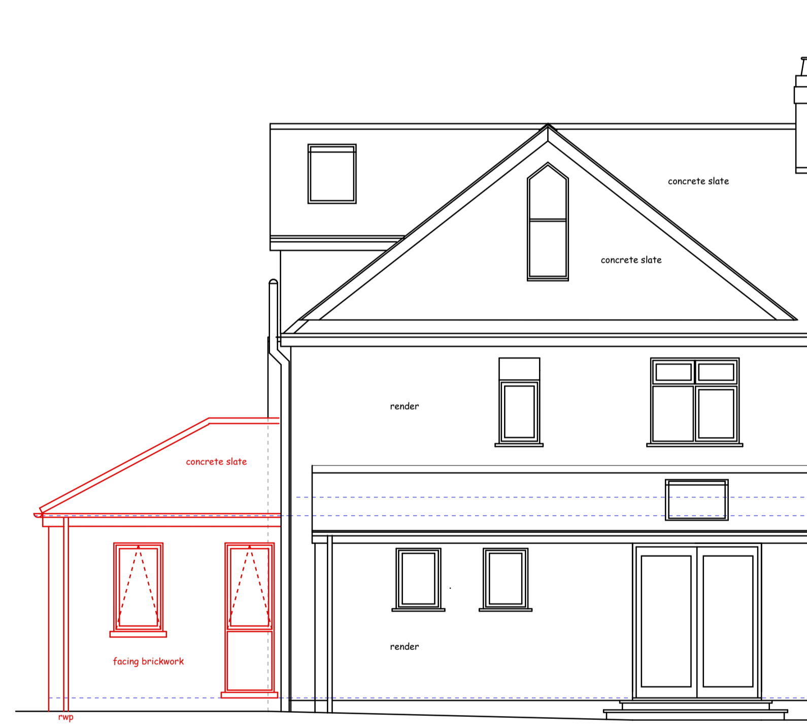
Proposed Rear Elevation - 1 : 50

Proposed Materials Roof - 35 degrees concrete slate with 200mm eaves with black fascia and barge boards Rainwater Goods - black gutters and rainwater pipework External Walls - Buff clay facing brickwork to match existing Windows/doors - PVC-u to patterns indicated Existing Materials Roof - 35 degrees concrete slate with 200mm eaves with black fascia and barge boards Rainwater Goods - black gutters and rainwater pipework External Walls - Buff clay facing brickwork or painted render Windows/doors - PVC-u to patterns indicated