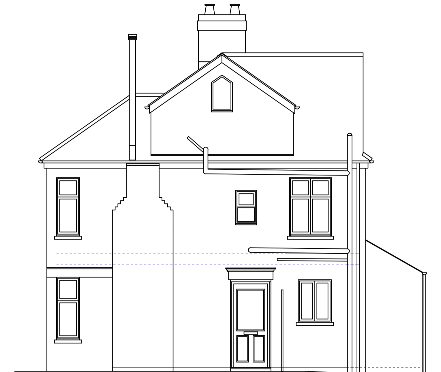
Existing Side Elevation - 1 : 50