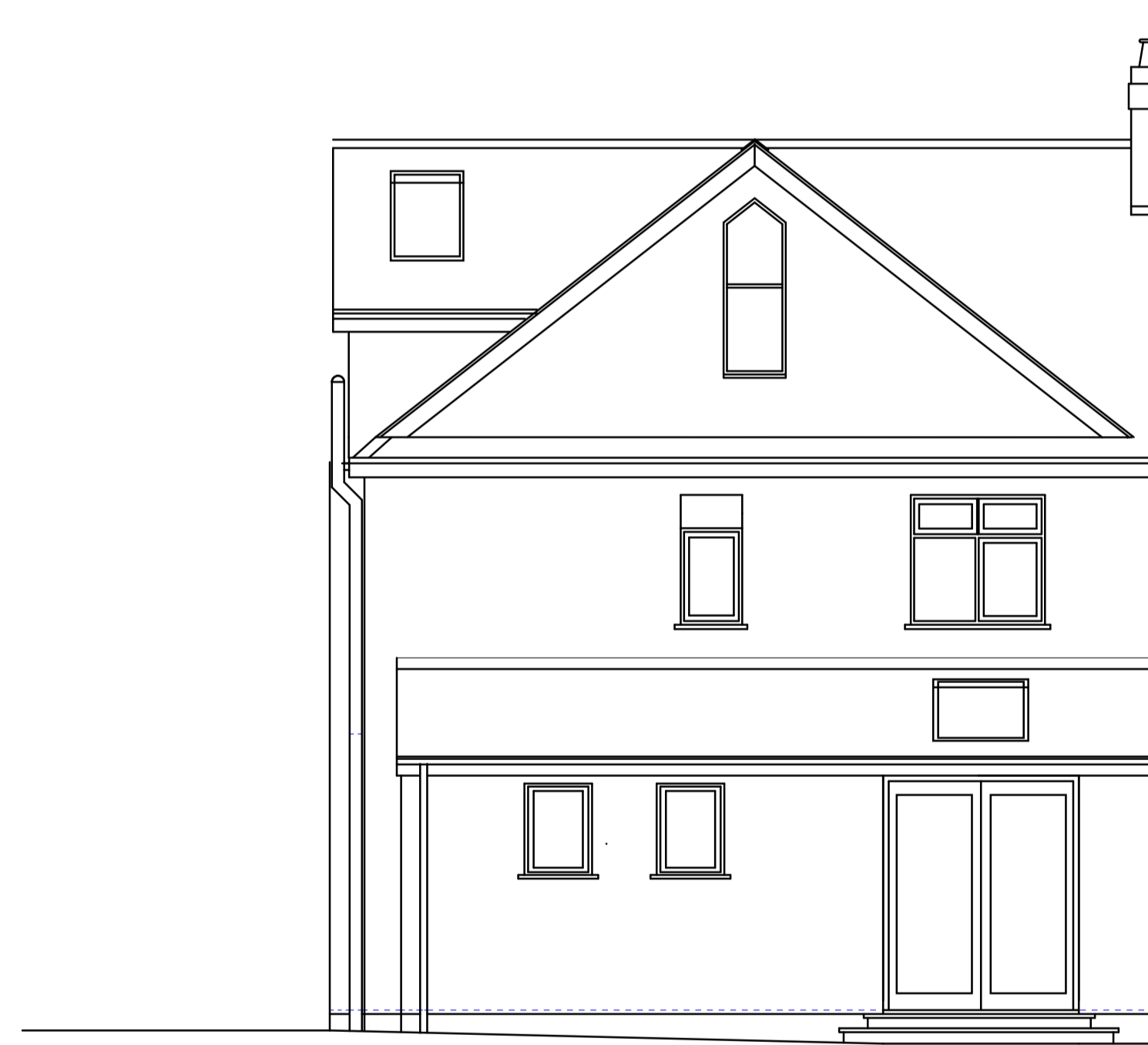
Existing Rear Elevation - 1 : 50

Existing Materials Roof - 3.5 degrees concrete slate with 200mm eaves with black fascia and barge boards Rainwater Goods - black gutters and rainwater pipework External Walls - Buff clay facing brickwork or painted render Windows/doors - PVC-u to patterns indicated