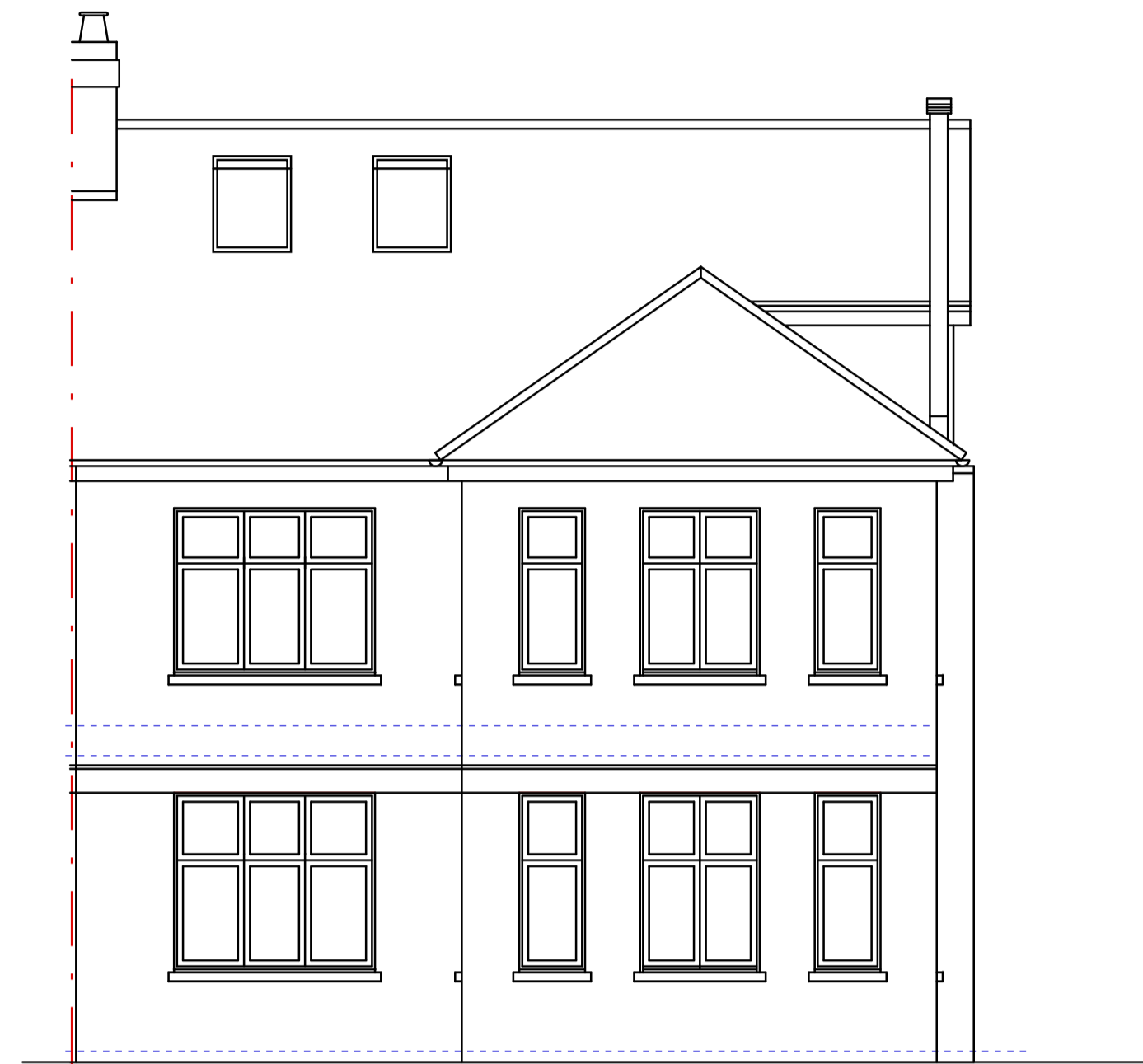
Existing Front Elevation - 1 : 50