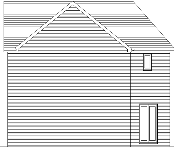
Side Elevation (North East facing)